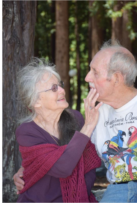
Forever 17 and 18 in their Hearts July 2015