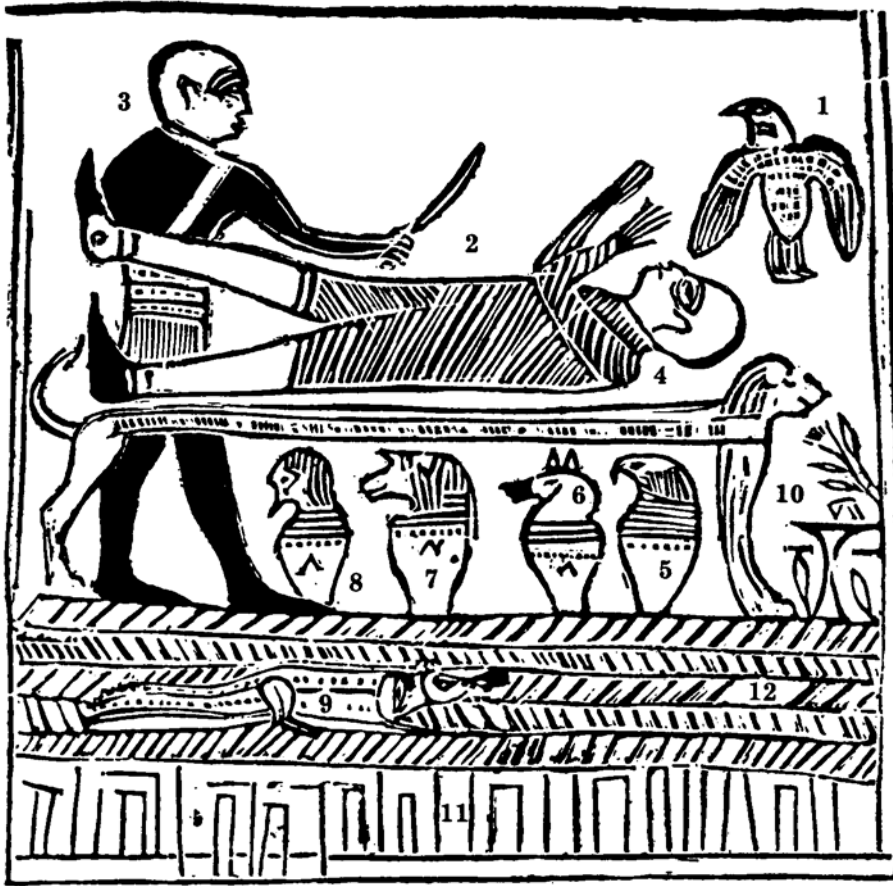
Facsimile 1 from the Book of Abraham.

idolatrous priests, standing before the gods of Elkenah, Libnah, Mahmackrah, Korash and Pharaoh,” referring to the lion couch, the four canopic jars, and the crocodile of the facsimile. Figure 5 is labeled “the idolatrous god of Elkenah,” referring to the falcon-headed jar, generally understood in its Egyptian context as Qebehsenuf, one of the four sons of Horus.