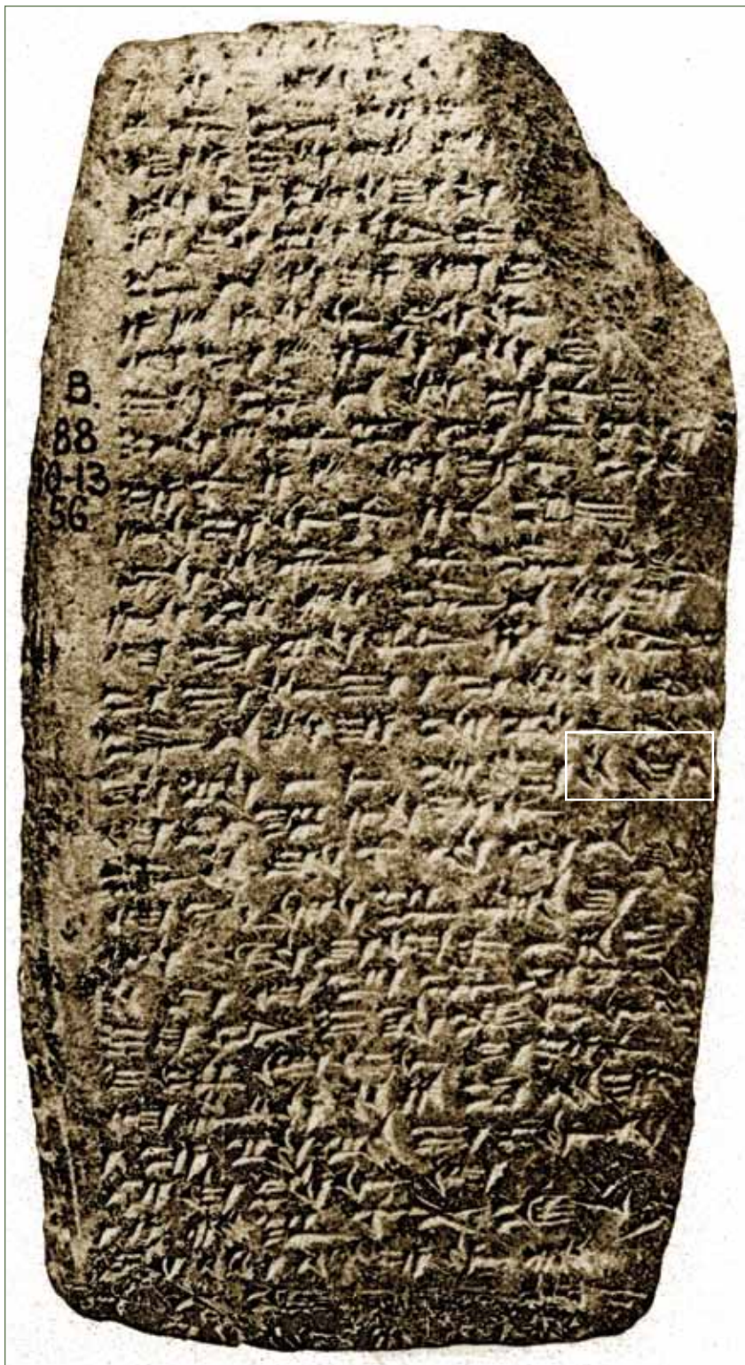
Tell El Amarna tablet from Egypt (E29813, obverse, object 1; 1888,1013.56). Inset: The Middle Babylonian word for Canaan, Kinahhi, appears about halfway down on the far right and wraps around the edge.