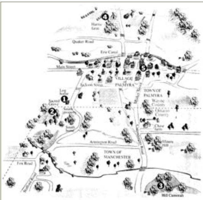
Sketch of the Palmyra area showing the Hill Cumorah and Miner’s Hill, which because of a cave located there, was at times confused with the Hill Cumorah.

Smith sandwiched the cave account (in italics) between President Young’s teaching on the united order and Smith’s record that he turned all his property over to local authorities. It is possible, of course, that Smith suddenly remembered the cave account and included it in his journal where he did, with the result that it misleadingly implies that Young used the story to illustrate a point he was making about consecration. However, if Smith’s sequencing of events is correct, the question arises that if the purpose of Young’s trip to Cedar City was to convert people to the united order and set it in motion, why did he talk about the cave? What makes this account of the cave