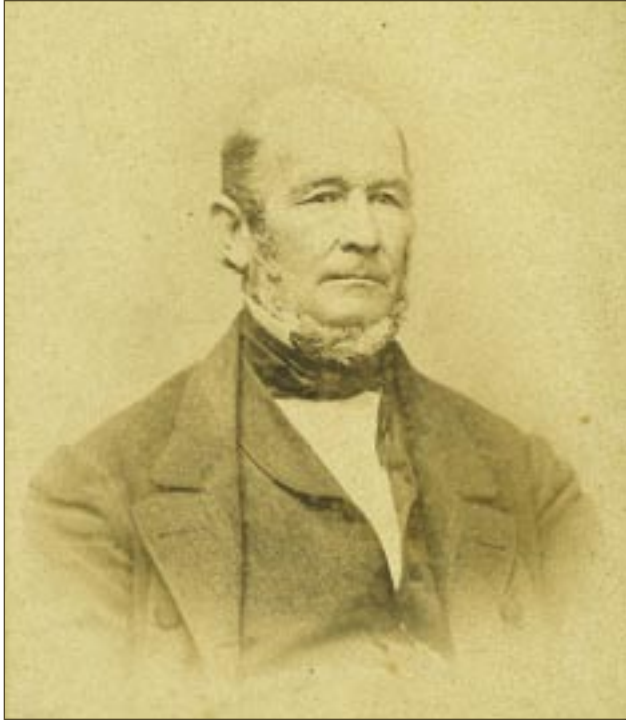
President Heber C. Kimball, first counselor to President Brigham Young.