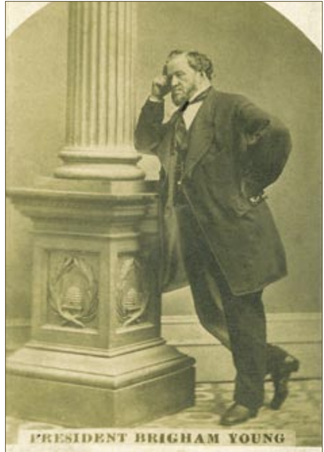
President Brigham Young.

Oliver Cowdery went with the Prophet Joseph when he deposited these plates. Joseph did not translate all of the plates; there was a portion of them sealed, which you can learn from the Book of Doctrine and Covenants. When Joseph got the plates, the angel instructed him to carry them back to the hill Cumorah, which he did. Oliver says that when Joseph and Oliver went there, the hill opened, and they walked into a cave, in which there was a large and spacious room. He says he did not think, at the time, whether they had the light of the sun or artificial light; but that it was just as light as day. They laid the plates on a table; it was a large table that stood in the room. Under this table there was a pile of plates as much as two feet high, and there were altogether in this room more plates than prob-