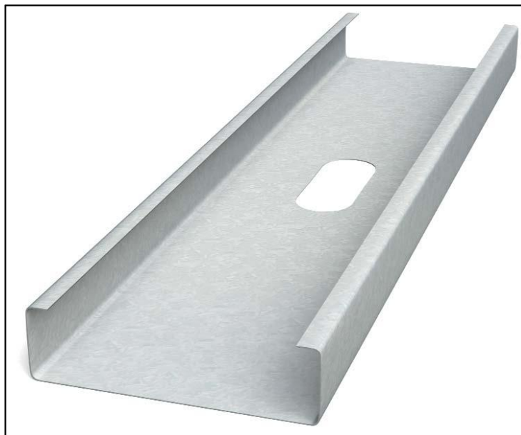
Figure 1: Picture of a C-Stud.