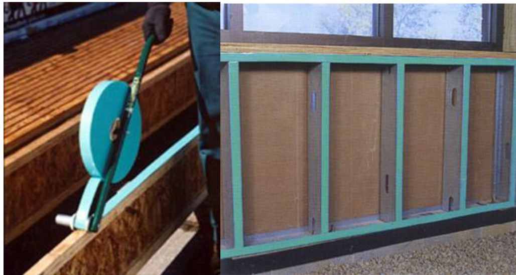
Figure 6: Integrity™ Gasket forms a thermal break at external wall framed with metal studs to prevent "shadowing" on gypsum board and reduce sound transmission. ( http://www.integritygasket.com/oldgallery1.asp )

A light gauge steel framer, Erik Elwell has framing with light gauge steel down to a science. One of the things he incorporates in his work is foam strips called Shadwell 143 Integrity Gasket shown in Figure 6 that attach directly to the studs and tracks – between the screws. This enhances the sound attenuation of the walls and creates a flat surface for hanging drywall (Elwell, 2005).