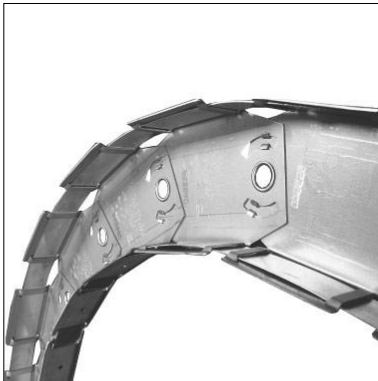
Figure 4: Flex-C Trac. ( http://www.proplaster.com.au/products/flex-c-trac-system-with-hammer-lock-feature )

Flex-C Trac (see Figure 4) with Hammer-Lock feature is offered by Flex-Ability Concepts. The company produces track for light gauge steel framing that curves, allowing the builder to quickly erect curved walls and arched doorways. The Flex-C Trac with hammer lock offers a feature where “once the track is formed simply hammer down the tabs to secure the shape. It’s fast and strong (Flex-Ability Concepts, 2007).”