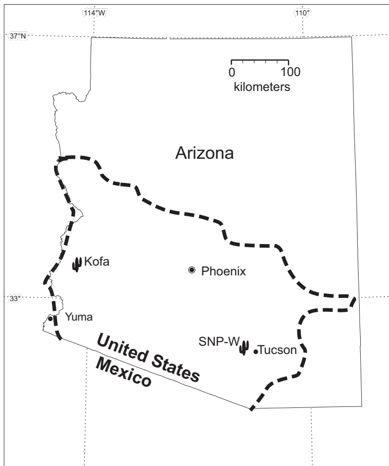
Fig. 1. Range of Carnegiea in the northern Sonoran Desert. Range adapted from Turner et al. (1995). The Kofa and SNP-W field sites are marked.

environmental and climatic conditions (Drezner 2003c). This factor is an index value that can be used to compare growth rates in different populations. Although the relationship between branch growth rate and primary stem growth under varying environmental conditions is also unknown, relative growth rates of branches surely reflect differences in the environment. I assume that if a plant grows twice as fast at site A than at site B (for example), then branch growth will similarly be twice as fast at any given length. For example, at any given height, a plant with a factor of 0.70 will grow twice as fast as plant with a factor of 0.35. It is important to highlight that this ratio has been previously established for these 2 sites (Drezner and Balling 2002, Drezner 2003c) and has simply been applied here. These values were