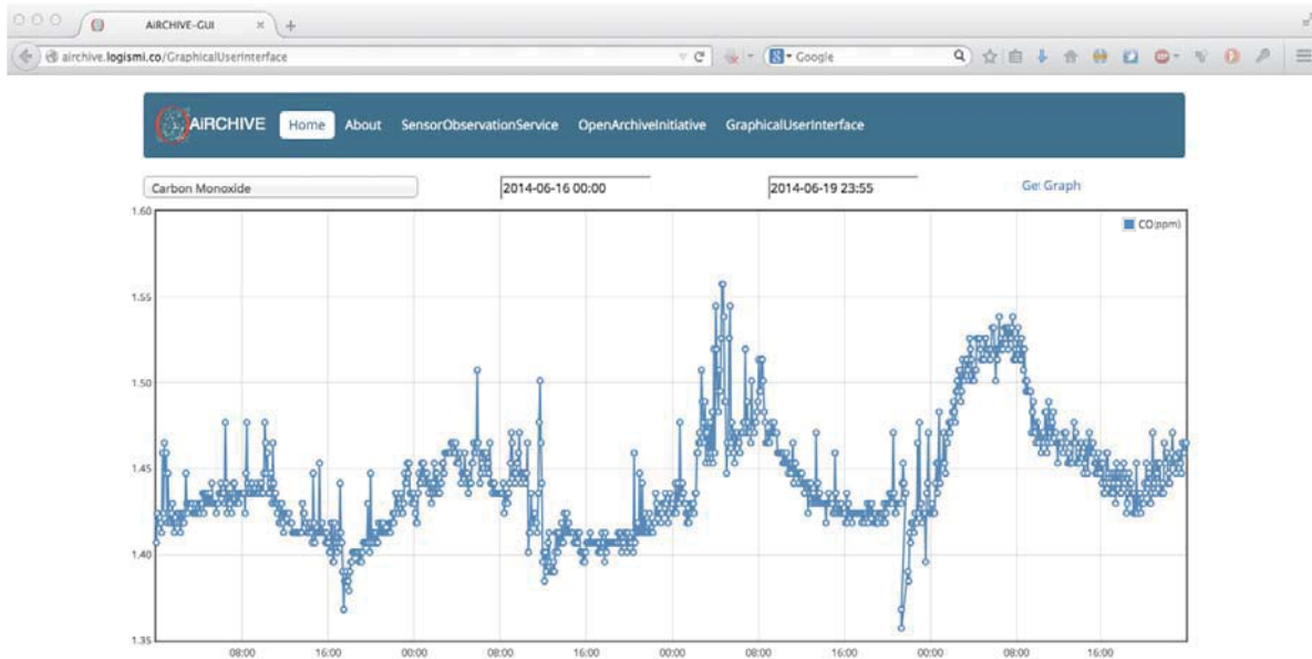
Figure 3. The GUI visualization. Using the FLOT framework, the user may create a graph to visualize Carbon Monoxide recordings for the period of the iEMSs conference (June 16-19, 2014).