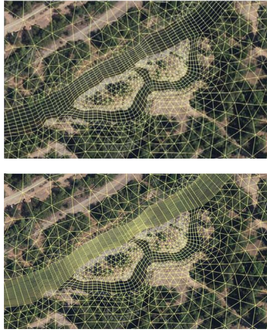
Figure 1. An example of the calibration mesh on the Trinity

The width of main channel mesh elements is 1/8 of the local channel width. Side channel mesh elements are 1/3 of the local side channel width. Calibration mesh elements range from approximately 10 to 50 feet in length and 5 to 25 feet in width. The mean area of calibration mesh elements is 284 square feet.