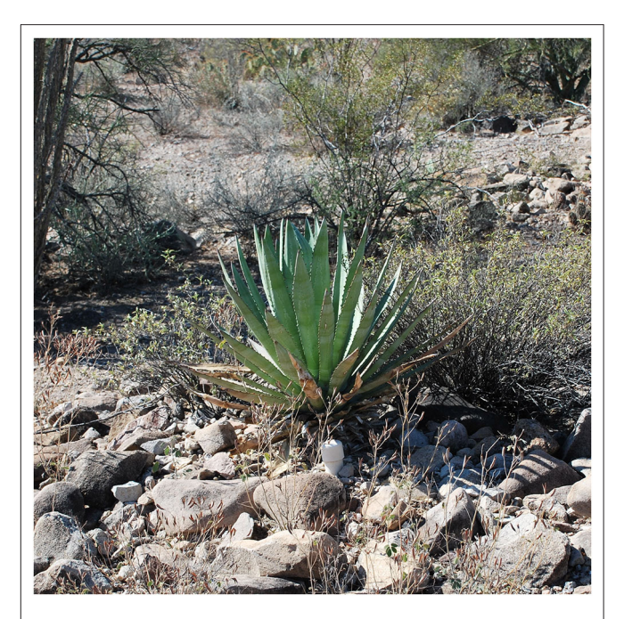
FIGURE 1 | Hohokam rock pile remains at Tumamoc Hill reserve in Tucson, Arizona.

In the American Southwest, as in pre-Hispanic northern Mexico, the Hohokam implemented dryland agriculture strategies to