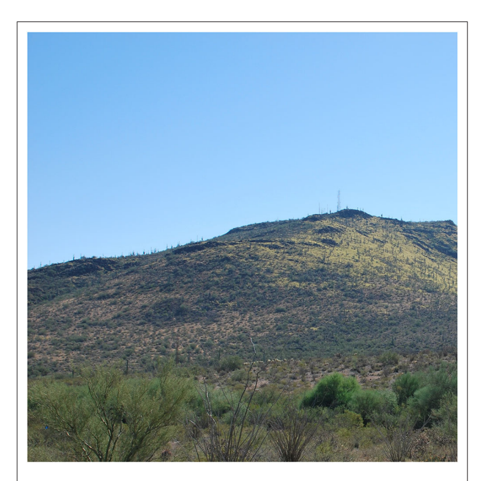
FIGURE 2 | Archaeological site at Tumamoc Hill reserve in Tucson, Arizona.

that Agave productivity in Arizona was possibly higher than previously calculated by Fish et al. (1985) (i.e., 102,000 Agave plants in 500 hectares). For example, between 1000-3000 Agave angustifolia plants ha<sup>-1</sup> can be annually cultivated in Sonora, Mexico in grasslands with no irrigation (Cervantes et al., 2007). Similarly, McDaniel (1985) suggested a planting density of 2,000-2,500 of Agave americana plants ha<sup>-1</sup> cultivated in grassland in southern Arizona. If the calculations of Cervantes et al. (2007) and McDaniel (1985) regarding Agave cultivation area and planting density are applied to the largest Hohokam rock-pile field in Marana, Arizona, the minimum planting density would be 1,000 plants ha<sup>-1</sup> for 500 ha of rock-pile fields. As such, the Hohokam potentially had the capacity to cultivate nearly 500,000 agaves, which is at least five times more plants than previously estimated by Fish et al. (1985). However, commercial modern Agave cultivation differs from the cultivation strategies of the Hohokam. This example is only used to highlight the productive potential of the land to cultivate agaves in the region.