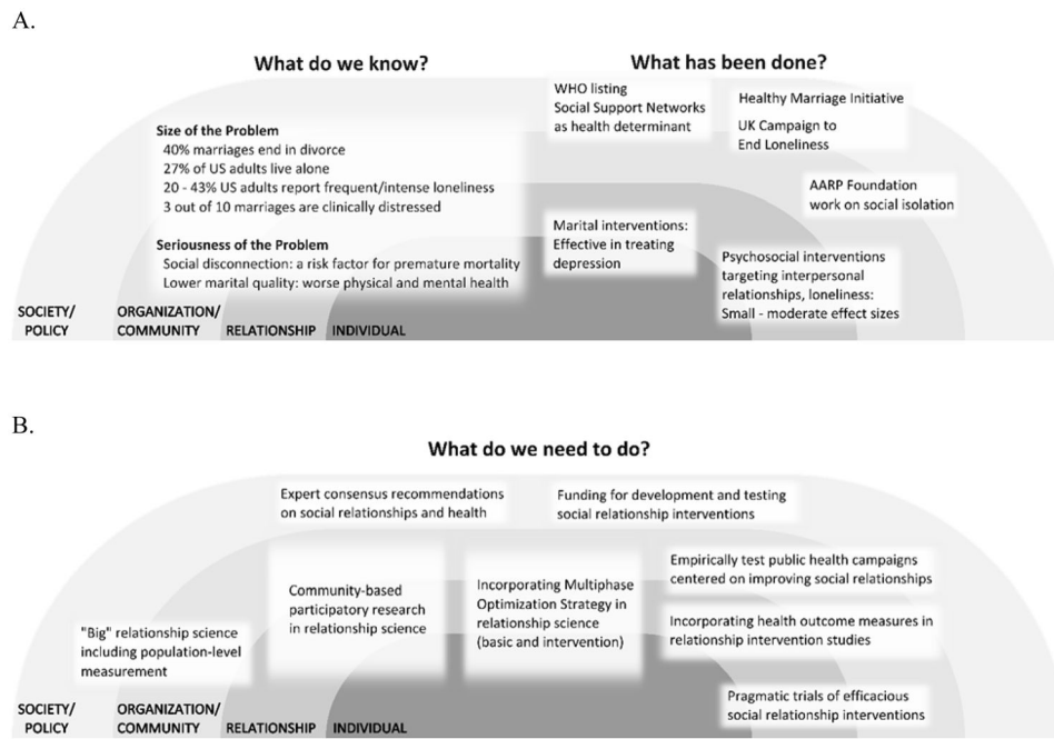
Figure 2. A) The state of relationships and health science embedded in a social ecological model. Text boxes are positioned in their respective levels of analysis (individual, relationship, organization/community, society/policy) and some boxes span multiple levels (i.e., individual and relationship). B) Recommendations for researchers, government agencies, health care providers and associations, and public/private health care funders to integrate social relationships into current public health priorities.