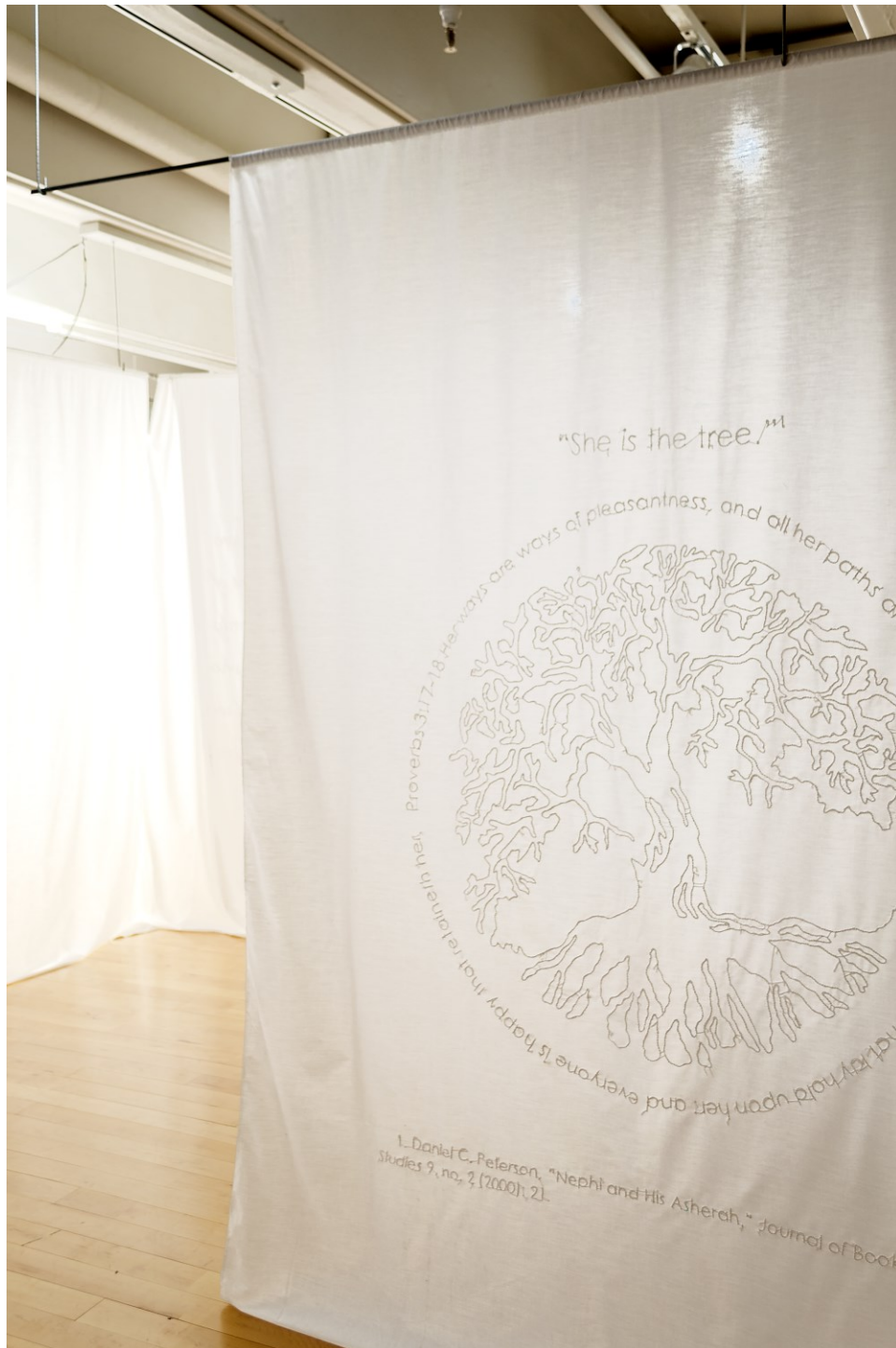
Picture of a panel of embroidery from thesis exhibition