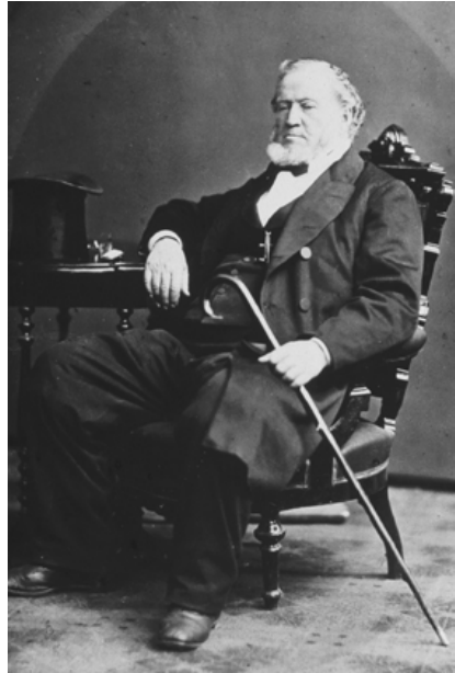
Brigham Young at approximately age seventy-five.