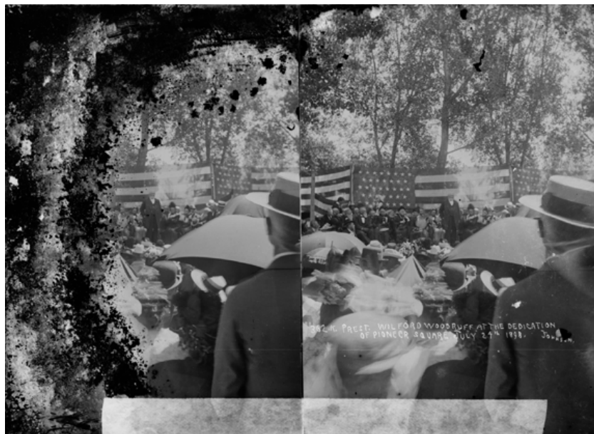
FIGURE 2. Stereo glass plate of Wilford Woodruff addressing a crowd during the dedication of Pioneer Square in Salt Lake City, Utah, on July 25, 1898. Charles E. Johnson, photographer (PH 9612, 12.5 cm × 16.1 cm), Charles E. Johnson glass-plate negative collection, circa 1890 to 1898, Church History Library. A notation on the glass-plate negative states on the lower right, “362.K. Prest. Wilford Woodruff at the Dedication of Pioneer Square. July 24 th 1898. Johnson.” Johnson incorrectly dated the event on the glass plate negative as July 24, 1898; the dedication was held July 25, 1898.

The stereo glass-plate negatives (figs. 2, 4, and 5) were discovered in 2013 among a large collection of 624 glass-plate negatives taken by Johnson between 1892 and 1912. 86 The date of the event is routinely incorrectly identified as July 24, 1898, in published and online sources, including the application to place the park on the National Register of Historic Places. Interestingly, Johnson himself incorrectly identified the date on the glass-plate negatives as July 24, 1898 (see figs. 1, 2, 4, and 5).