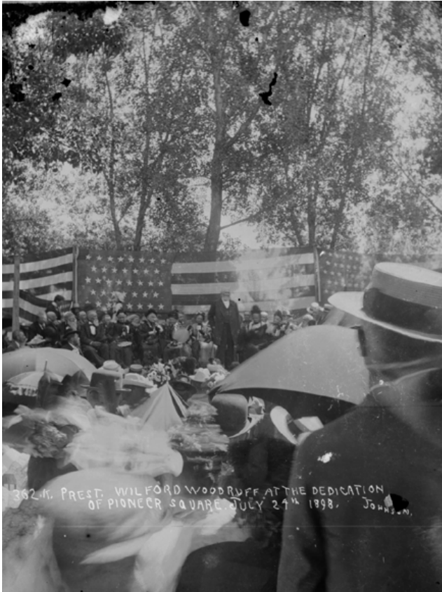
FIGURE 1. Wilford Woodruff speaking at the dedication ceremony of Pioneer Square in Salt Lake City, Utah, on Monday, July 25, 1898. Johnson wrote on the glass-plate negative, “362.K. Prest. Wilford Woodruff at the Dedication of Pioneer Square. July 24 th 1898. Johnson.” Johnson incorrectly dated the event on the plate; the dedication was held July 25, 1898.