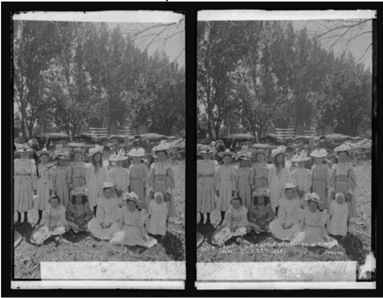
FIGURE 4. Stereo-view glass plates of girls at the dedication of Pioneer Square, July 25, 1898. Charles E. Johnson, photographer, PH 9612, Church History Library. These plates are mounted separately; the plate on the left is 12 × 8 cm, and the plate on the right is 12 × 8.1 cm. Written on the glass plate on the lower right side is “363K Group of Girls at the dedication of Pioneer Square. Johnson.” Johnson misdated the image on the glass-plate negative as July 24, 1898.