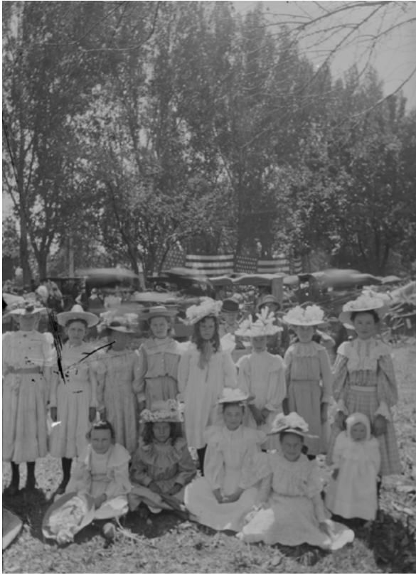
FIGURE 3. Group of girls at the dedication of Pioneer Square in Salt Lake City, Utah, on Monday, July 25, 1898.

source information, it seems reasonable to assume, since the carriages and crowd of people are stationary in the background, it was taken before the program began. If it had been taken after the program ended, there likely would have been more movement as people left the ceremony.