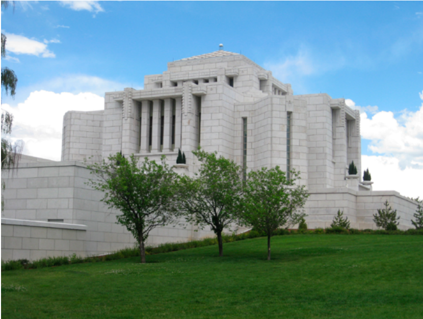
Cardston Alberta Temple, which combines the influences of Frank Lloyd Wright and Mayan-Aztec architecture.

the spokes of a wheel, each room facing one of the cardinal directions. The celestial room would be placed in the center at the very top of the building, with the baptistry directly below. This arrangement placed the rooms in a practical and symbolically appropriate relationship to each other. As a person moved through the ordinance rooms he followed a circular path, finally coming through into the center in the celestial room. Each room was also a few steps higher than the one before, with the celestial room and the adjacent sealing rooms being the highest of all. Thus, the architectural arrangement expressed the same idea of progression that is found in the temple ceremony itself.