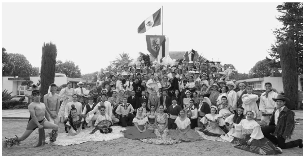
Cultural celebration at the final graduation at Benemérito, recognizing the school's long history as a cultural center for Mexican Latter-day Saints.

United States, Mexico, and throughout Latin America who are preparing to teach in Spanish. 93