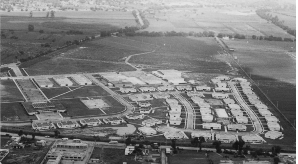
Benemérito school complex seen from the air, showing fifty student houses completed during the year 1967–1968.