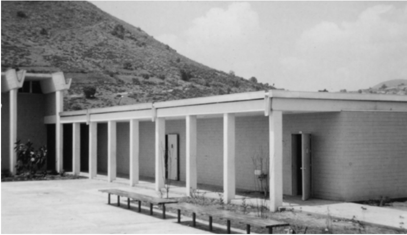
First buildings at Benemérito, c. 1964.

Even though the enrollment at Benemérito stayed consistent for the next decade, changes were afoot that would eventually transform the school into a unique preparatory school. In 1971, the Church adopted a policy to “not duplicate otherwise available” educational opportunities. 92 By the 1980s, the Mexican government was providing more educational opportunities for most elementary and secondary students. Therefore, in 1984, all Church primary and secondary schools were phased out, including those at Benemérito. As a result of closing the primary schools, the normal school at Benemérito was also discontinued. Since 1985, Benemérito de las Américas has functioned solely as a preparatory (high) school. Over the next quarter of a century, enrollment gradually increased in the preparatoria school to over two thousand a year.