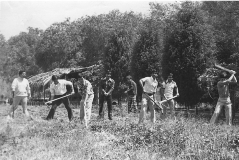
Students and employees at work on the grounds of Benemérito, c. 1967. Photo from record book kept by staff of Benemérito.