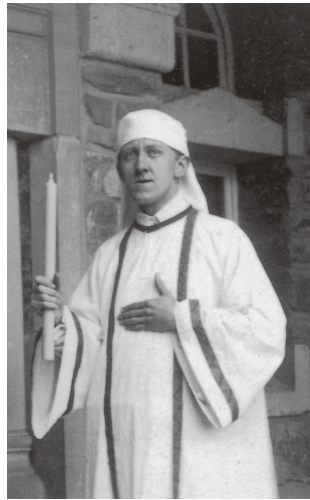
Laxness in his priestly attire at the monastery.