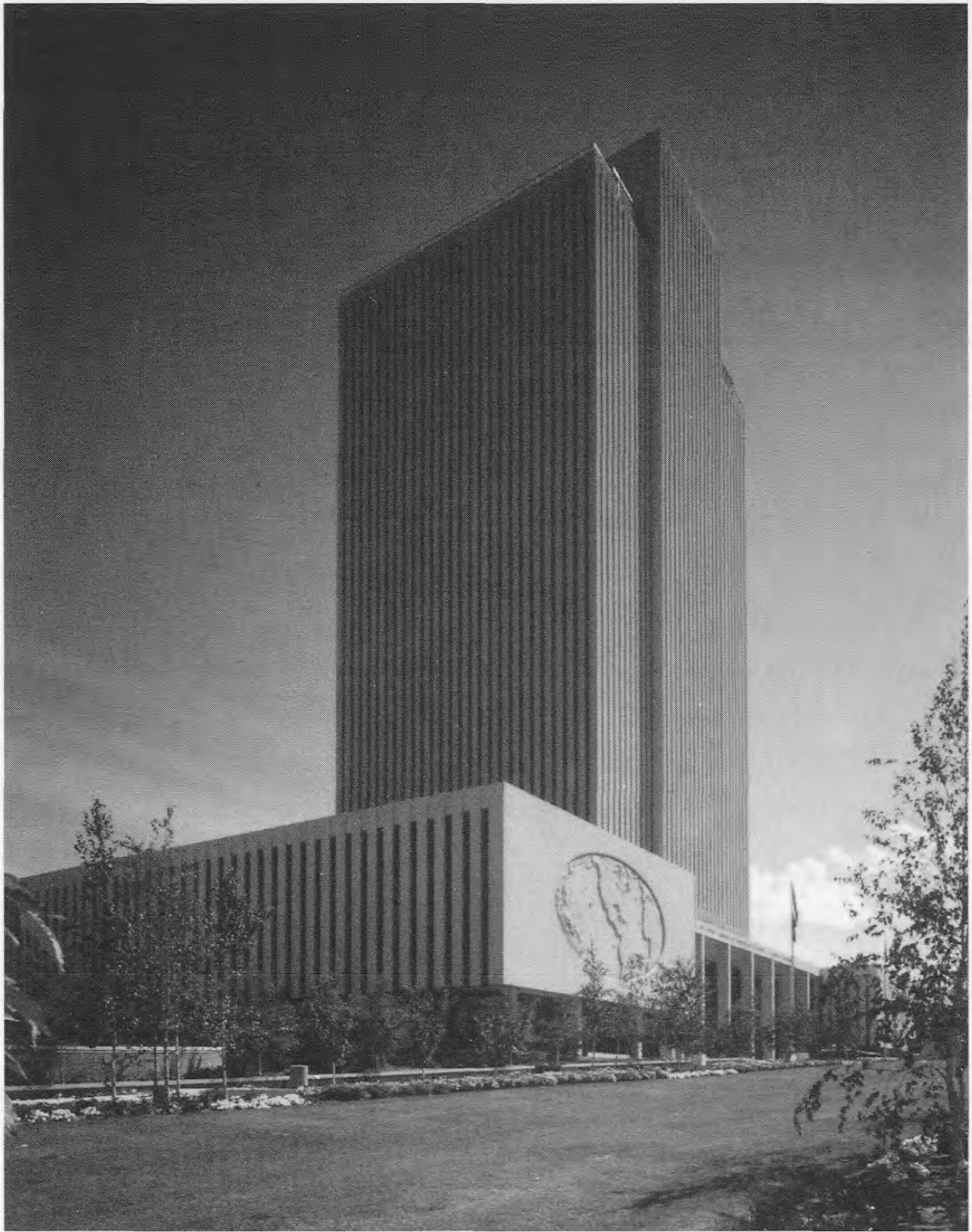
Church Office Building, ca. 1972. The Genealogical Society was located in the west wing, 1972–85.