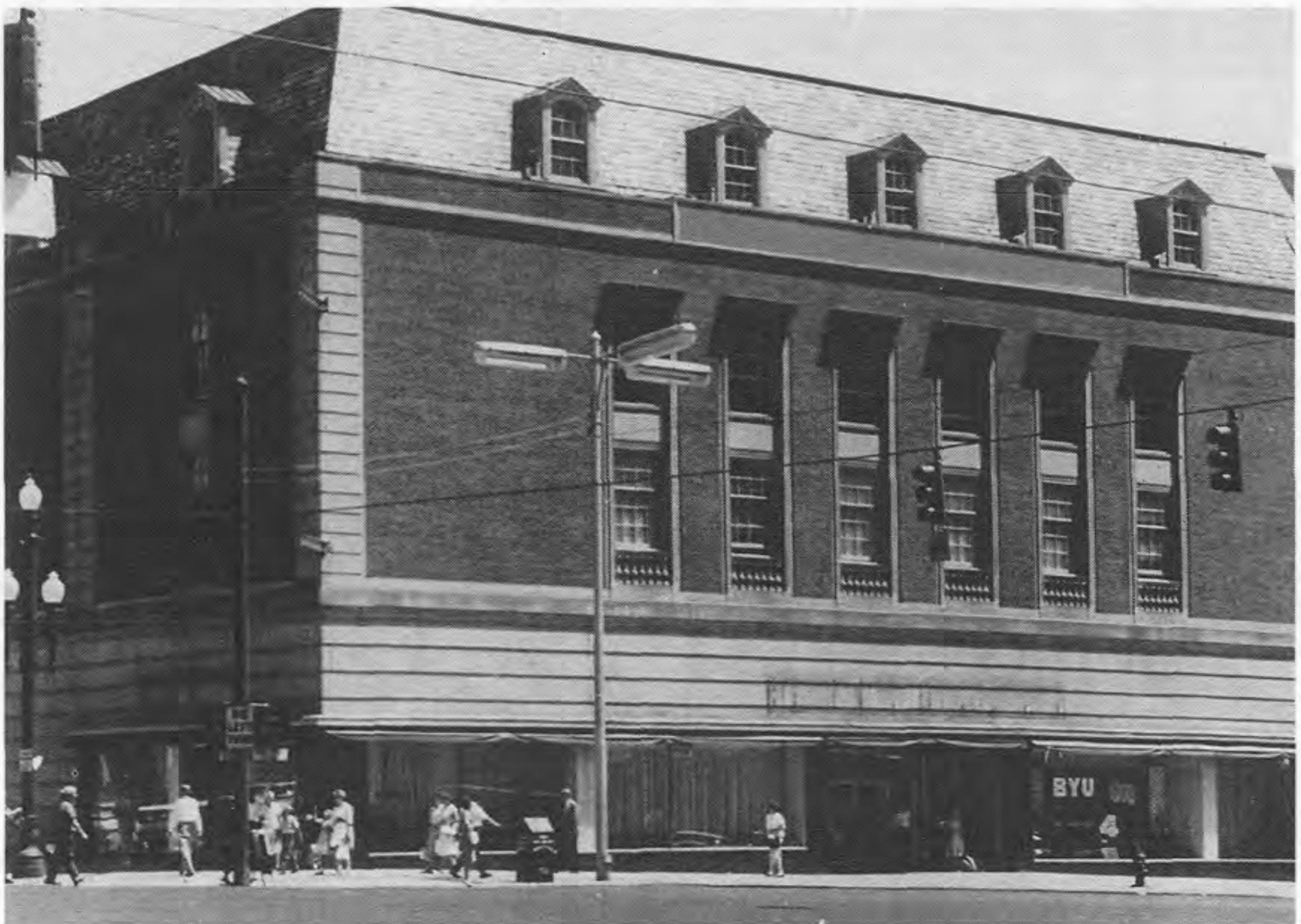
Montgomery Ward Building, ca. 1962, at 107 South Main, Salt Lake City, location of the Genealogical Society, 1962–72.

The need for new facilities became acute in 1960, when the city announced plans to widen the street where the Joseph F. Smith Memorial building was located. The plans meant that the