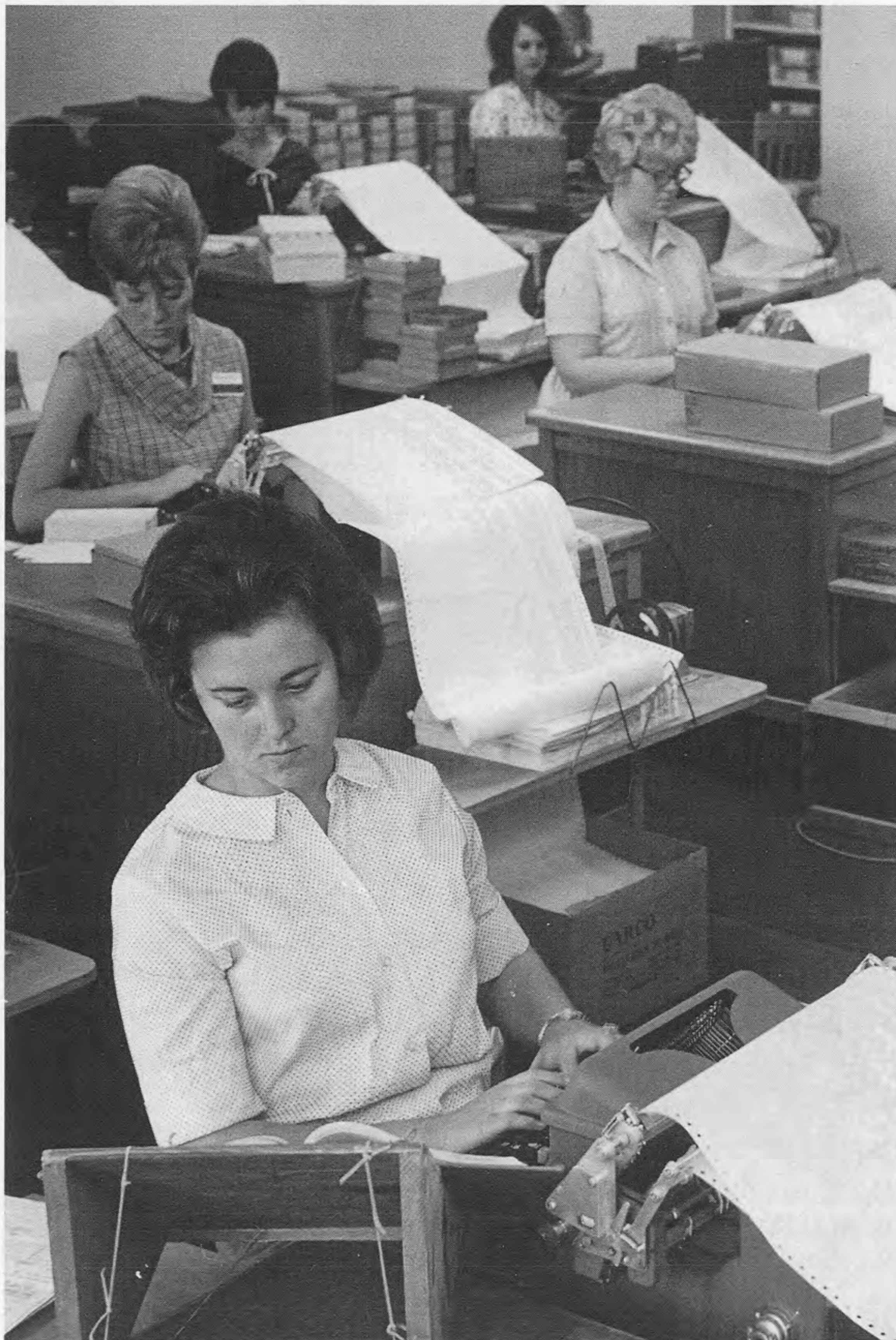
Staff using flexowriters, ca. 1965. The flexowriter produced a punched paper tape. The data from this tape was transferred to a magnetic tape and then fed into a computer.