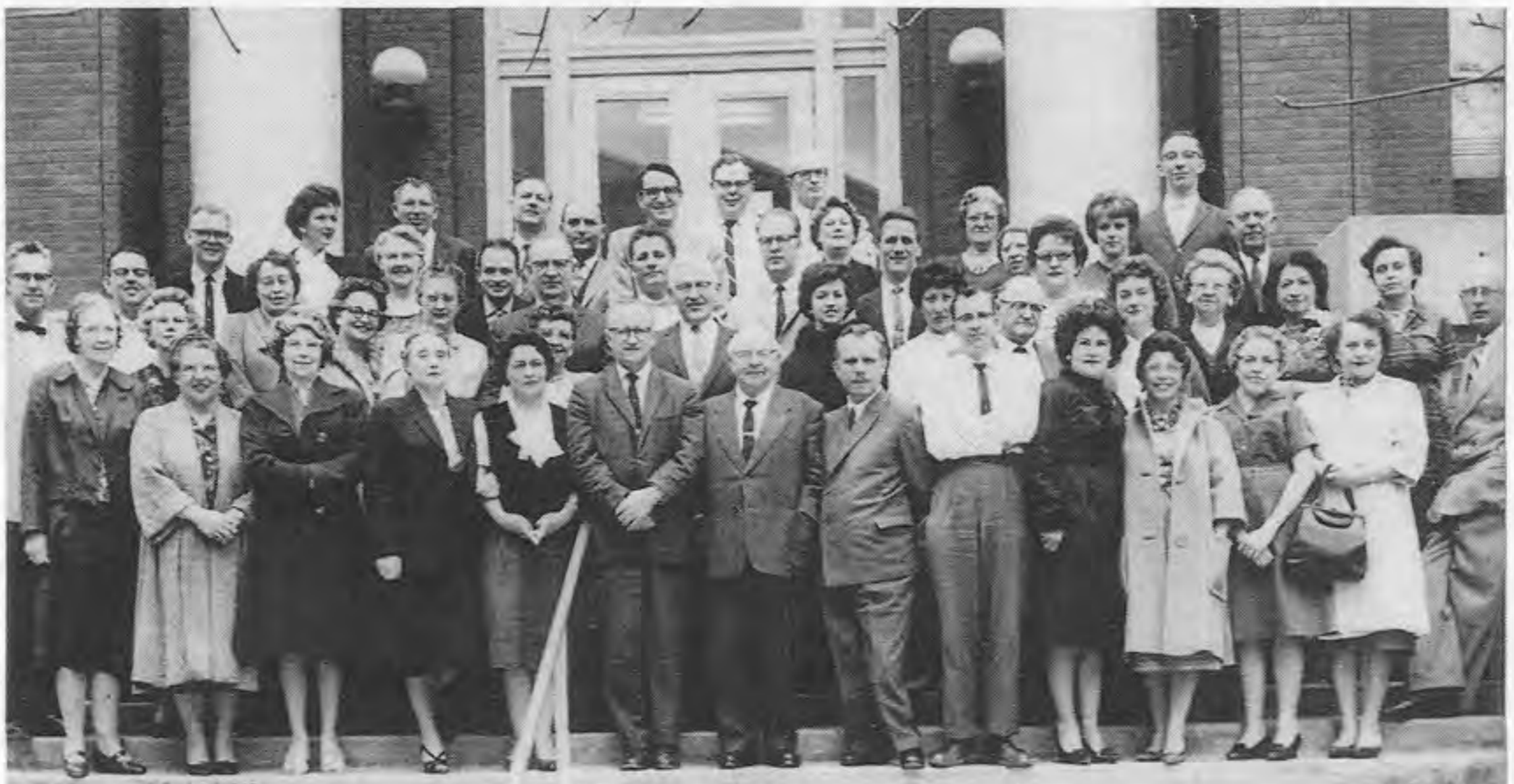
Society staff, 1962, in front of the Joseph F. Smith Memorial Building.