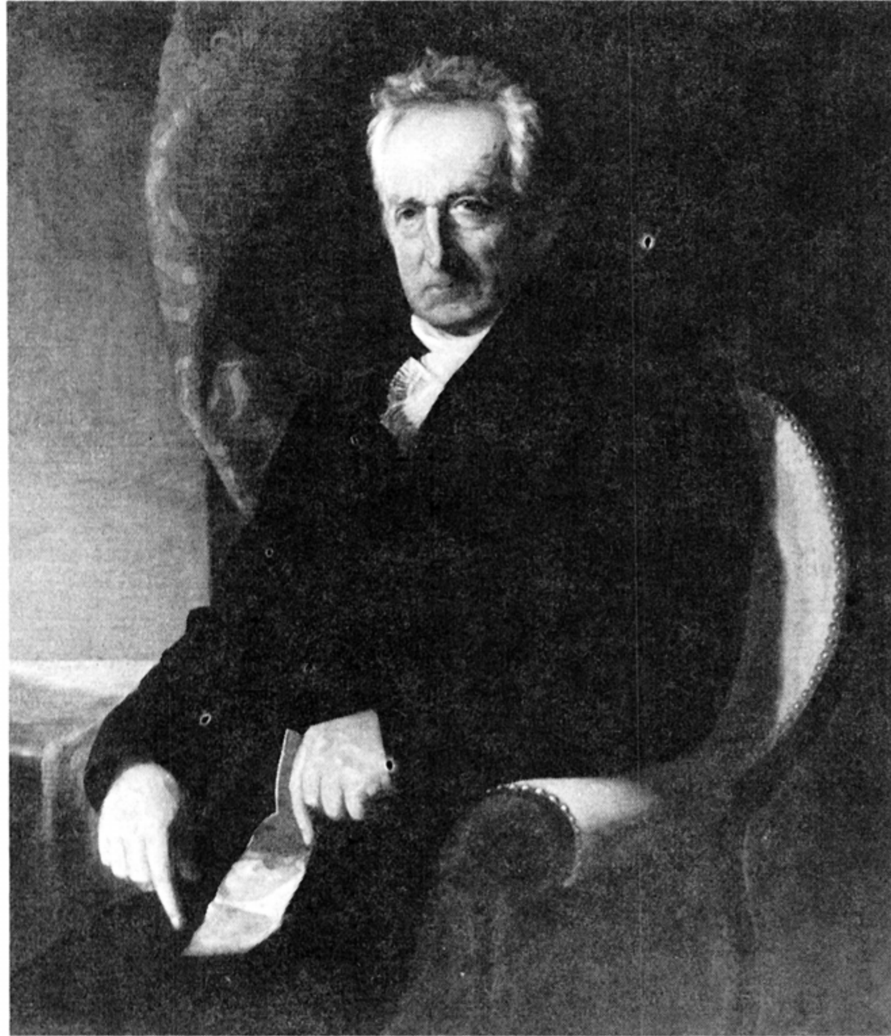
Professor Nathan Smith, by Samuel Finley Breese Morse, Gift of the Medical Class of 1828.