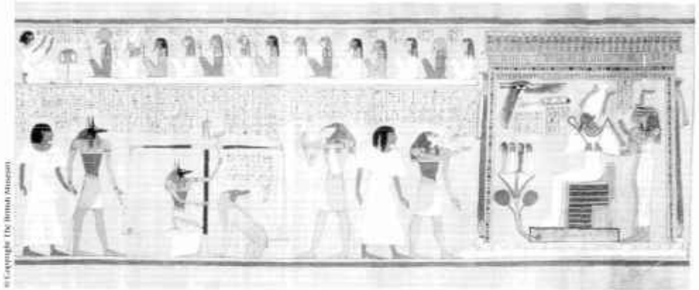
FIG. 3. The Weighing of the Souls, a scene from the Book of the Dead of Hunefer, from Thebes, Egypt, ca. 1275 BC. In Egyptian mythology, the souls of deceased individuals were weighed against a feather. Those whose sins were lighter than the feather were able to proceed to a paradise. Pictured on the right are Osiris (seated) and Isis (standing), waiting to meet the souls entering paradise.

and to win Pamina: "Are you ready to give your life in your struggle to attain them?" "Yes!"