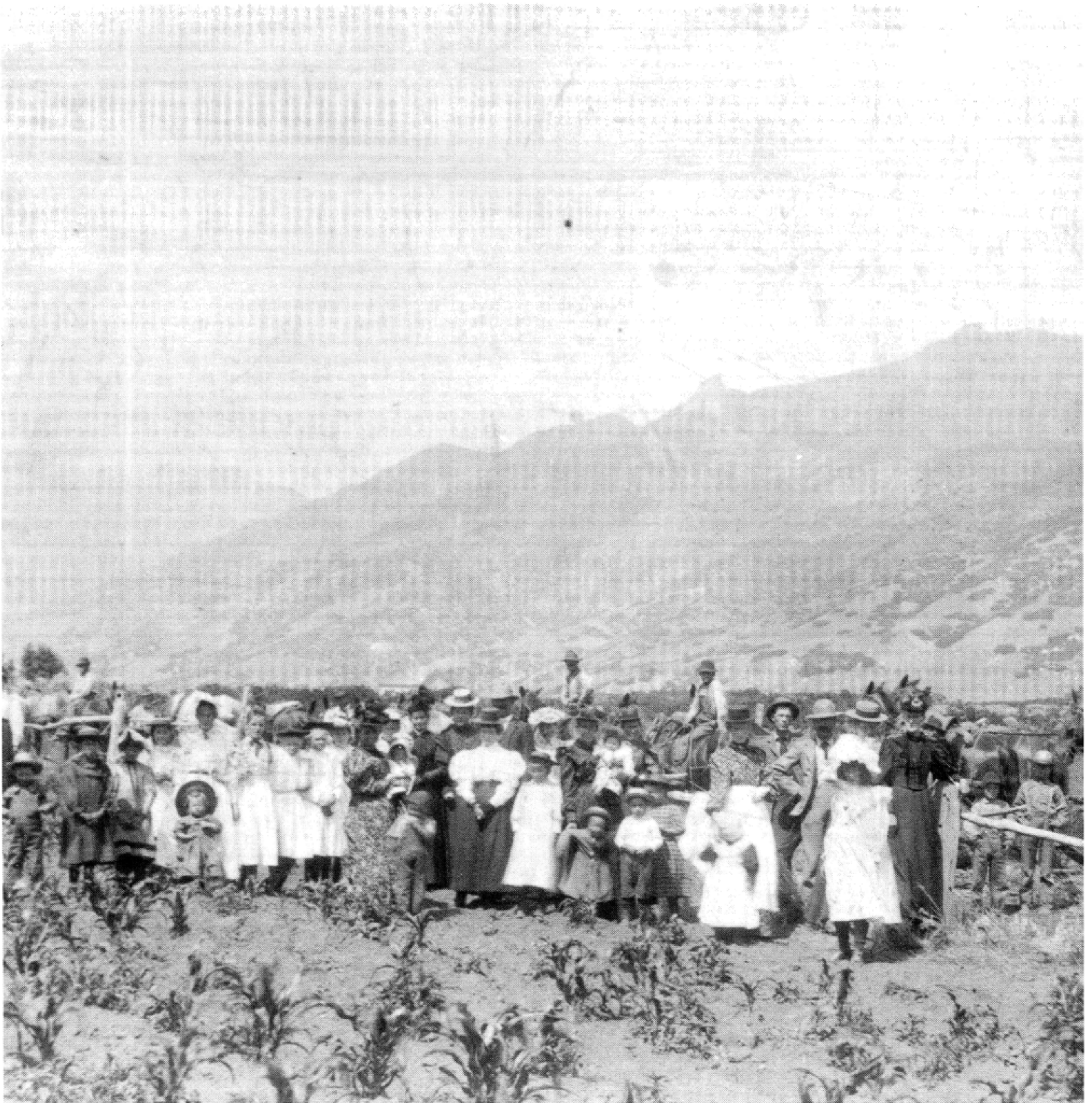
FIG. 2. Onlookers and workmen paused in June 1897 to memorialize the culmination of “a vast amount of labor and considerable ingenuity.” The large stone for the Brigham

advanced $8,000 to the association for work on the granite pedestal. By this time the association had decided on a new location for the monument: the intersection of Main and South Temple Streets. Agreeing that a monument to the pioneers should be in this more public place, the Salt Lake City Council deeded to the association a plot of ground 25' x 25' at the intersection. 4