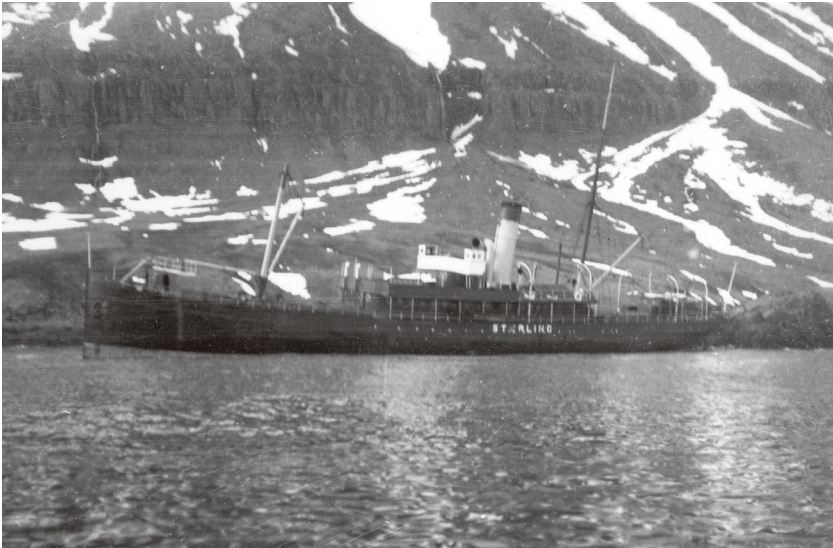
FIG. 1. The steamship Sterling (note the name in white on the side of the vessel). Andrew Jenson and Alma L. Petersen sailed on this ship in their 1911 voyage to Iceland.

The Sterling weighed 1,040 tons and was built in Scotland in 1890. It was wrecked in 1922, but the passengers and crew were saved. Jón Björnsson, “ Sterling ,” in Íslensk Skip , vol. 3 (Reykjavík: ÍÐUNN, 1990), 122.