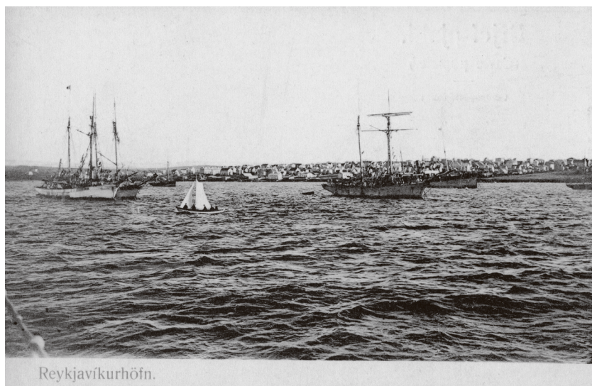
FIG. 4. The bay at Reykjavík, Iceland, about 1900.