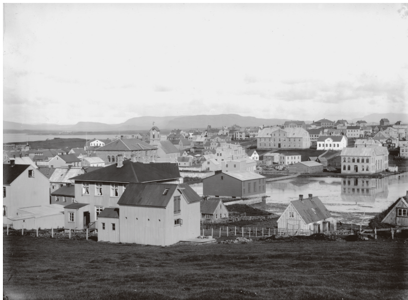
FIG. 5. The town of Reykjavík about 1900. In the center of this photograph is a building with dark walls and a light-colored roof. This is Bárubúð Hall, where Andrew Jenson gave two illustrated lectures as a missionary tool.