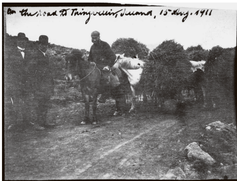
FIG. 6. "On the road to Thingvellir, Iceland, 15 Aug. 1911."

chasms, gulches filled with water and rents and splits in the black rocks which abounded everywhere in this region. We had prayer in a lovely secluded spot among the hills. Our journey this day was over through a rough, rocky, hilly country and over a road that was merely a trail, but with great care two-wheeled vehicles could be taken over it. This whole section of country abounded with lava beds and the whole island is of volcanic origin. After crossing a number of ridges we at length descended into a beautiful grassy valley called Langarvatnsvellir, then crossed another ridge to Lanrgarvatn when, on the edge of this lake, there are three or more boiling springs. When we nooned together with an Austrian traveler (Otto Volkert, a young merchant from Vienna) and his Icelandic guide, and we sent to a neighboring farm house for eggs which we boiled in one of the hot springs. [Figs. 7 and 8.] We also bought milk and [p. 676] thus enjoyed our dinner. Continuing our journey we forded a number of streams, only crossing the largest river (the Brūarā) on a bridge. Crossed over a number of rocky ridges and finally reached the geyser tavern at 8 o'clock p.m. very tired after riding about 33 miles during the day. While we were eating a most scanty meal at the dirty, one-eyed hotel, a the voice of an Englishman was heard saying loudly, "Come and see," and we all ran at the top of our