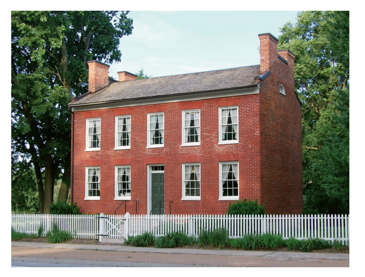
The Wilford Woodruff home in Nauvoo.