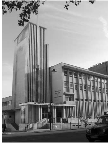
FIG. 3. Hyde Park meetinghouse, 2005. This building, erected in 1961, stands among museums, university buildings, and a concert hall—all near where the Crystal Palace once stood.