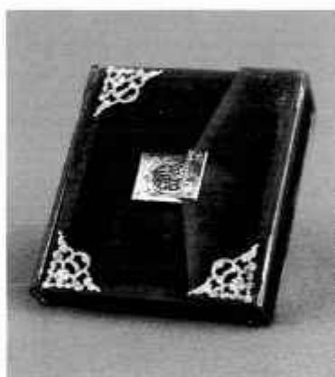
FIG. 2. The velvet case housing the Brigham Young daguerreotype.