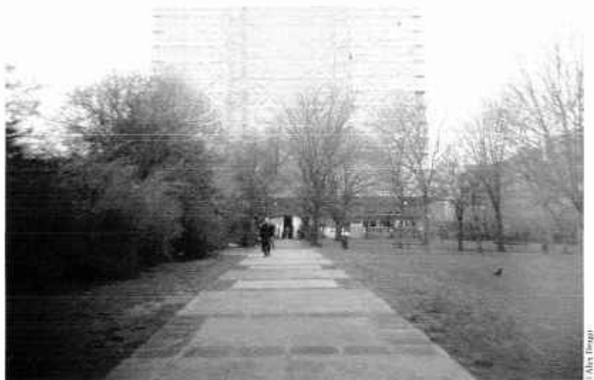
FIG. 5. King's Square. Brigham Young preached his first London sermon in this area.

mentioned it. I am convinced that he and Elders Kimball and Woodruff were unwittingly adding to the remarkable religious history of St. Luke's.