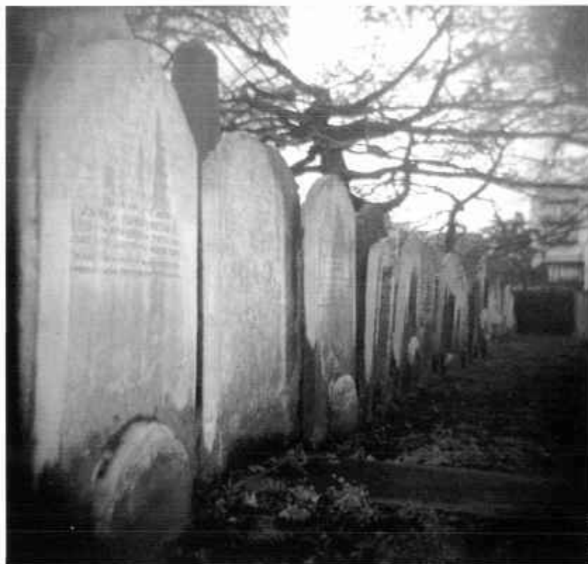
FIG. 2. Bunhill Fields. Buried here are some of the great religious thinkers and Nonconformists of England: George Fox, John Bunyan, Isaac Watts, William Blake, and Susanna Wesley, mother of John and Charles Wesley.

The Papists, they cry conform. And the Turk, he cries conform. And did not the heathen emperors cry conform? And the Presbyterian, he cries conform. And the independents . . . so all these cry, conform. So every-