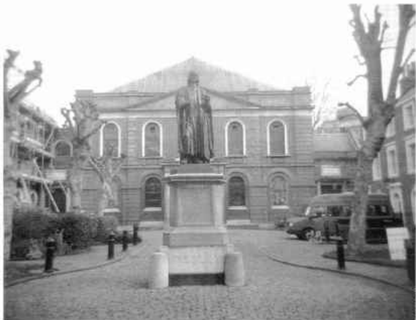
FIG. 3. Wesley's chapel. The monument in the foreground commemorates the conversion of John Wesley, who went on to establish Methodism.

John's "strangely warmed heart" proved to generate a phenomenal heat that sustained a most remarkable life of service and teaching. The Wesleys were ordained Church of England priests and never left the church. It was not their intention to start a new church; rather they just wanted to apply their beliefs and, in a methodical way, serve as they felt Christ would serve. John was warned by his superiors in the Church of England that to pretend to gifts of the spirit was a "horrible thing" and that he should confine himself to his own parish. But John would have none of it and declared, "The world is my parish." True to his word, he preached in all parts of England, taking the message to the poor coal miners of Northumberland and Wales, visiting prisoners condemned to die, and ministering to the people whom the Church of England bishops regarded as unworthy of their attention. Even today the coal mining areas of South Wales remain strongholds of Methodism. In the common parlance, people were either "Chapel" (Methodist) or "Church" (Church of England), and South Wales was and still remains "Chapel."