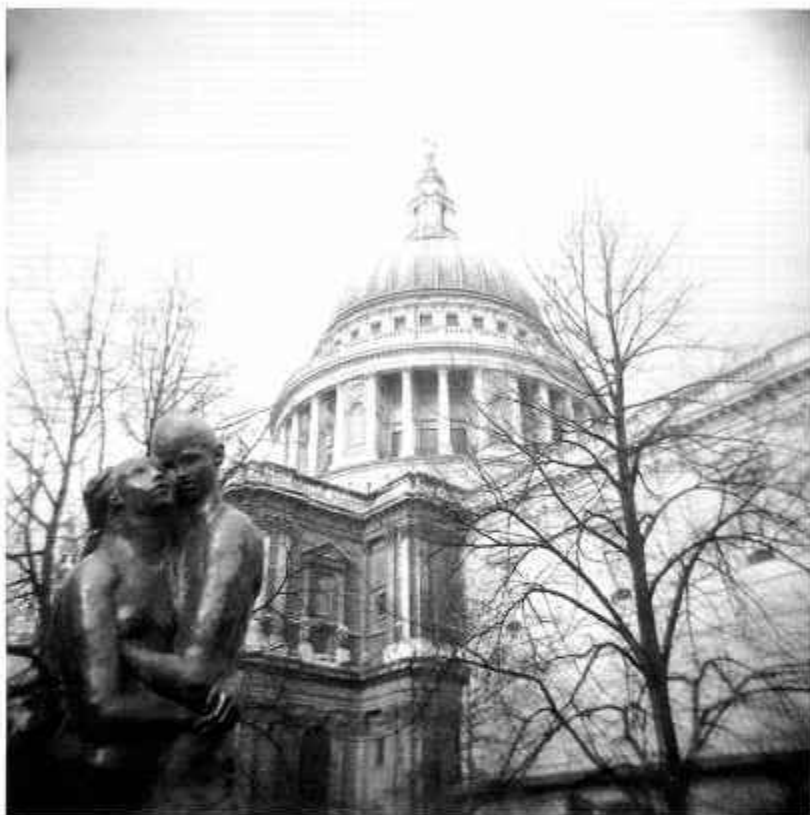
FIG. 1. St. Paul's Cathedral in London, England, wherein thousands gathered after the World Trade Center atrocity.

working in the shadow of St. Paul's Cathedral in London (fig. 1), and I think of St. Paul's as my cathedral. It is an inspirational building that I never tire of viewing. After September 11, 2001, I stood on the pavement outside my cathedral with thousands of my fellow Londoners, who could not fit inside, to pay my respects to those murdered in the World Trade Center atrocity. It was a deeply poignant moment in which thousands of my fellows were outwardly showing solidarity with their American counterparts while inwardly silently pleading for God's help.