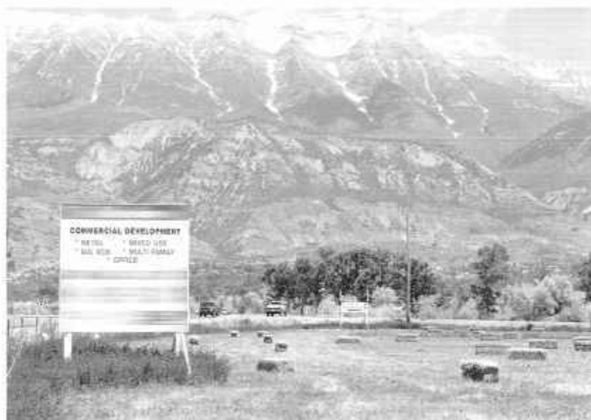
FIG. 4. New automobile-dependent developments creating urban sprawl in Utah County, 2005. Such development is consuming agricultural lands and open space along the Wasatch Front.

the nation, emphasizes automobile-dependent, low-density, single-use development expanding on the fringes of existing communities (fig. 4).