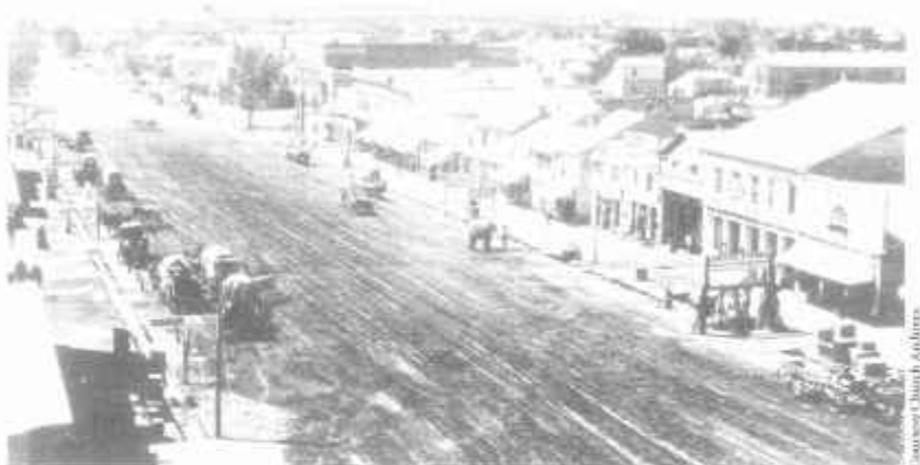
FIG. 2. Wide streets in Salt Lake City, ca. 1869. The city was laid out with streets wide enough for a wagon to turn around. This width made it easy for the city to adapt streets for automobile and mass transit use in later years.

Brigham admonished the pioneers to beautify and take pride in their temporary Zion in the Rocky Mountains: "Progress, and improve upon, and make beautiful everything around you. . . . Build cities, adorn your habitations, make gardens, orchards, and vineyards, and render the earth so pleasant that when you look upon your labors you may do so with pleasure, and that angels may delight to come and visit your beautiful locations." 18 Similarly, George A. Smith counseled, "The plan of Zion contemplates that the earth, the gardens, and fields of Zion, be beautiful and cultivated in the best possible manner. Our traditions have got to yield to that plan, circumstances will bring us to that point, and eventually we shall be under the necessity of learning and adopting the plan of beautifying and cultivating every foot of the soil of Zion in the best possible manner." 19