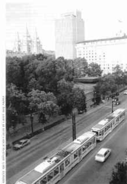
FIG. 5. Salt Lake City, 2002. Trax trains provide mass transit today, as did animal-drawn trolleys and electric streetcars in earlier times.