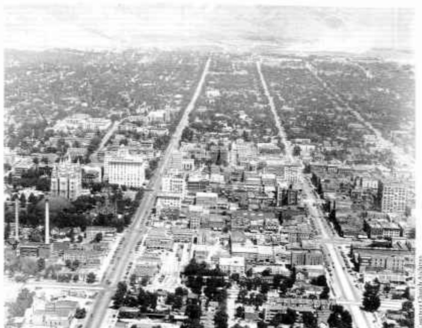
FIG. 3. Salt Lake City looking east, 1927. Laid out in a neat grid designed after the City of Zion Plat, the city benefits from a sense of order. The numbered streets make finding addresses simple.

on a daily basis, and 26 interurban trains carried over 800 passengers between Salt Lake and Provo each day. 29 In the late 1920s, as asphalt replaced most dirt roads to better accommodate automobile traffic, Salt Lake City was the first city in the world to outfit trolley cars with pneumatic rubber tires to be used without track. Delegations from twenty-six states and thirteen countries visited Salt Lake City to study the highly innovative design and operation of Salt Lake's trolley system. 30