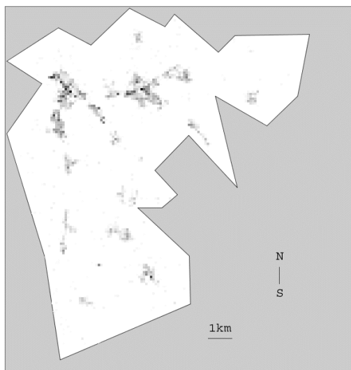
Figure 2. Spatial profile of simulated urine generation in rural model area on a weekday. Dots represent hectares (100 x 100 m squares); darker shading indicates a higher urine volume. (Analysis based on data from the 1990 population census provided by the Swiss Federal Office for Statistics.)