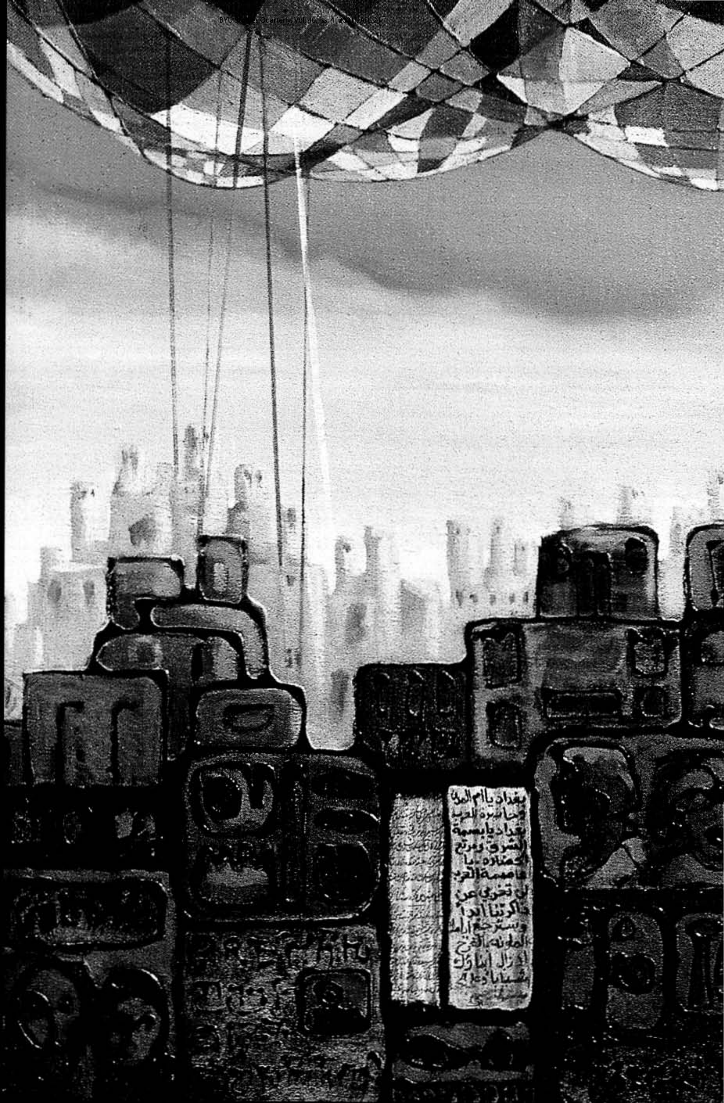
BY HASHIM AL-TAWIL. OIL ON CANVAS, 30" X 60", 1991.