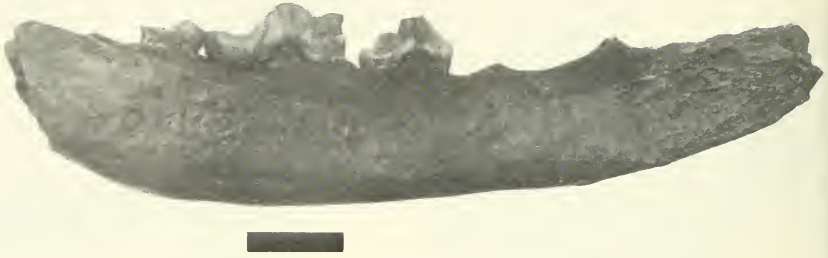
Fig. 4. Vulpes vulpes : UVP 81, lateral view of left dentary with P 4 -M 2 . Solid bar represents 1 cm.