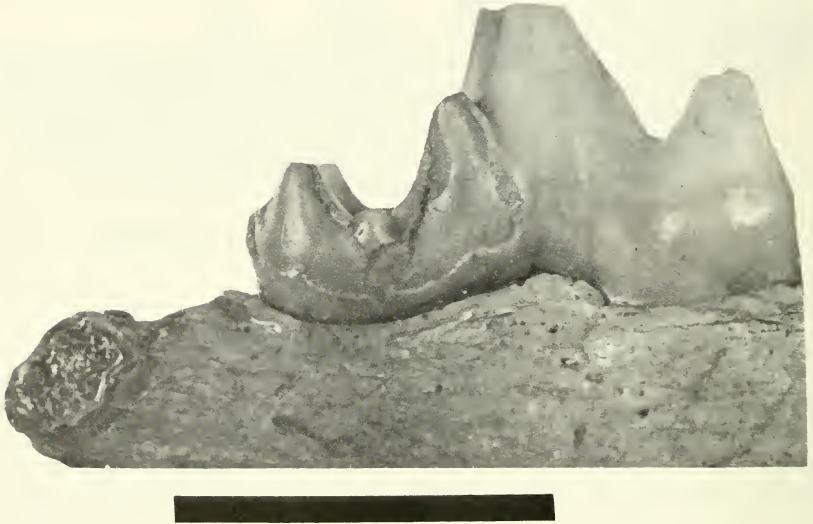
Fig. 5. Vulpes vulpes : Lateral view of lower carnassial of UVP 82. Note well-developed cusp at inner junction of talonid and trigonid. Solid bar represents 1 cm.

Members of the genus Vulpes differ from Urocyon in their relatively smaller molars and the shape of their mandible (Kurten and Anderson 1980). In Vulpes the "... lower border of the mandible forms an even curve without the lobe seen in Urocyon , ..." whereas in the Arctic Fox "... the premolars are higher crowned, M 1 has a distinctly shorter talonid, and the tubercular teeth are more reduced than in Vulpes ."