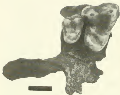
Fig. 1. Canis lupus : UVP 101, oclusal view of right M^1-M^2 . Solid bar represents 1 cm.