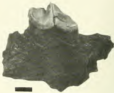
Fig. 2. Canis lupus : UVP 100, lateral view of left P^4 . Solid bar represents 1 cm.