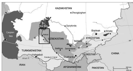
Figure 1: Location of the Amudarya river delta in Central Asia (delta area in rectangle)

The Amudarya delta is located in the semi-arid Turan lowlands of Central Asia in Uzbekistan and Turkmenistan (Figure 1). It is characterized by low precipitation (<100mm/year) and a strong continental climate. Runoff of the Amudarya river is almost exclusively formed by glacier and snowmelt in the Hindukush and Pamir mountain ranges in the upstream countries Tajikistan and Afghanistan.