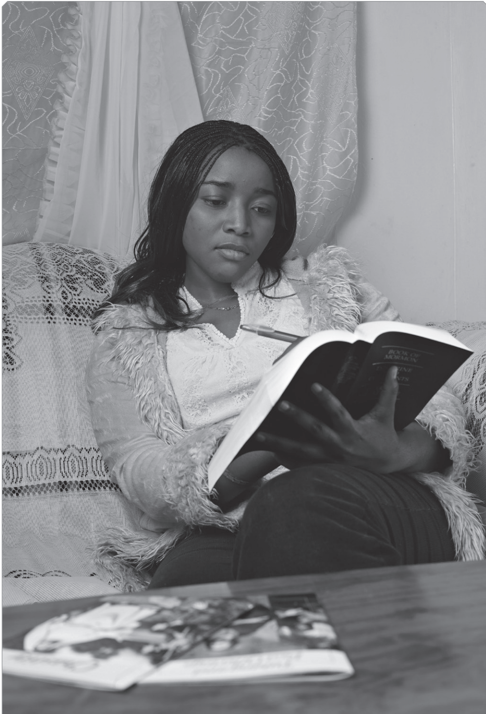
Craig Dimond, © Intellectual Reserve, Inc.

Understanding what questions are used in the Book of Mormon and how they are used to influence instruction enables readers to use questions to maximize teaching and learning.