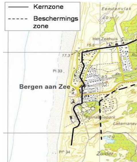
Figure 2: Safety lines for the town Bergen aan Zee, Netherlands

Case study area is the province of North Holland. Two coastal cities (Bergen aan Zee and Egmond aan Zee) are of great interest. There are several risk areas along the coast defined where a significant part of some coastal cities is located outside the safety line (see Figure 2).