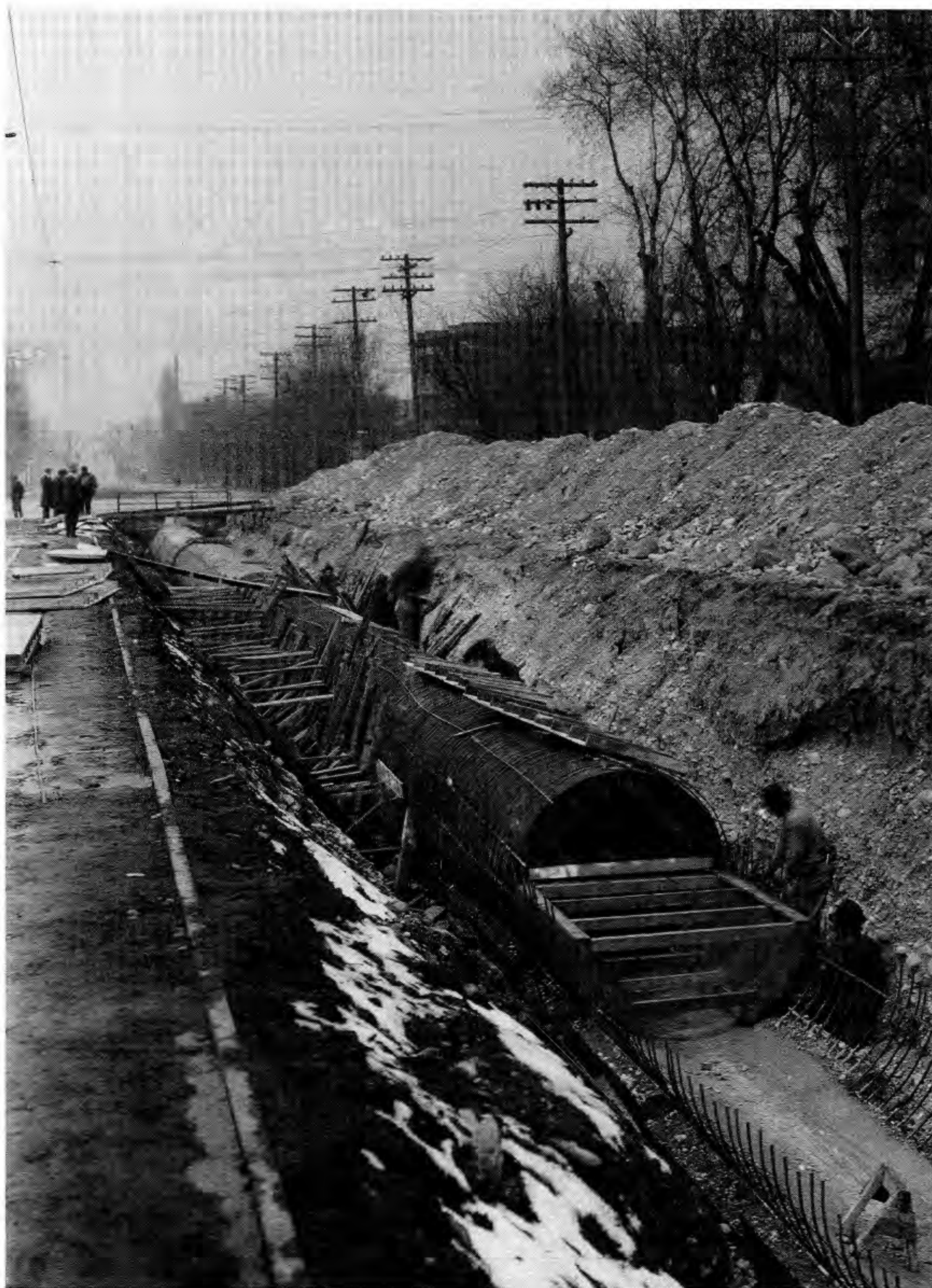
Building the North Temple Aqueduct. The rapid growth of Salt Lake City between 1880 and 1930 strained the city's culinary water resources. Between 1880 and 1931, reservoirs to supply additional water from Big Cottonwood, Emigration, and Parley Canyons were constructed. Aqueducts initially brought water for city use and later for private-home consumption. This scene looks west between West Temple and First West. Courtesy Utah State Historical Society, City Engineer's Collection, 1924.