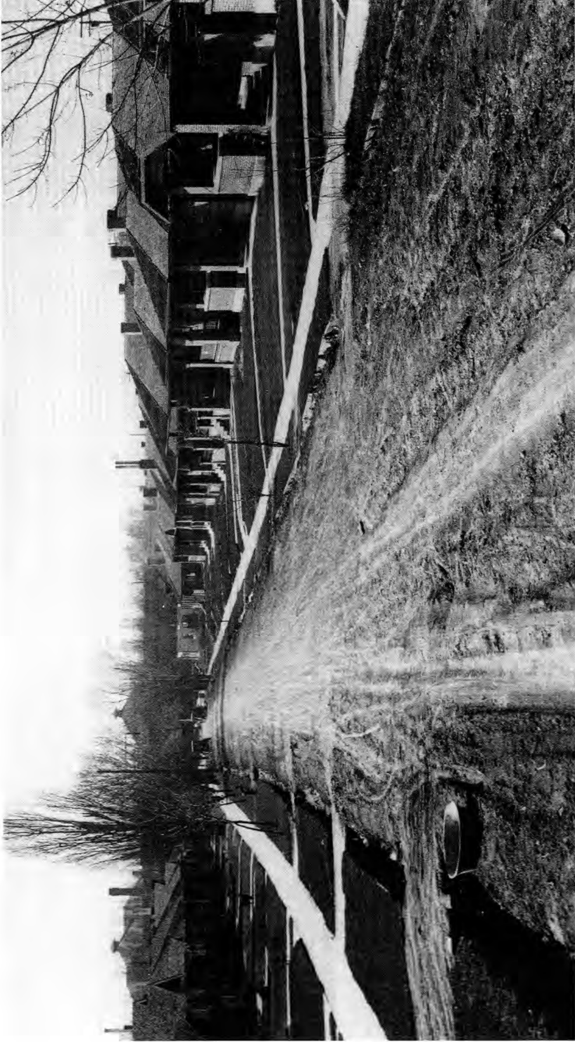
Emerson Avenue before improvements. Salt Lake, like other western cities, was known for streets that were commonly dusty during the summer and muddy during inclement weather. This photograph shows Emerson Avenue in the process of being improved. Courtesy Utah State Historical Society, City Engineer's Collection, 1927.