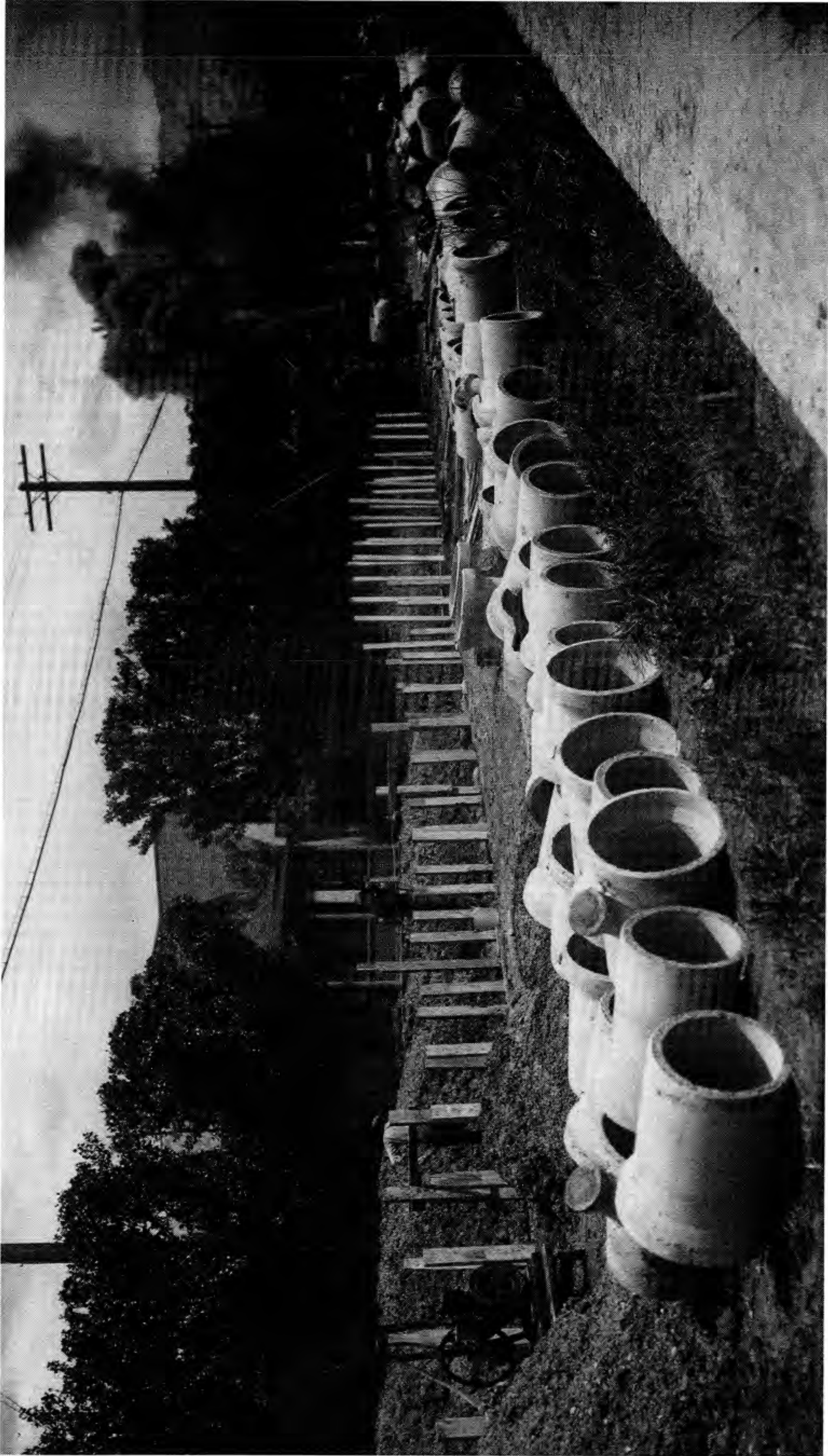
Laying sewer on Eleventh South, Salt Lake City. As sewer lines such as this one were laid, citizens gradually converted from private privies to the city's emerging sewer system. The viewer is looking east from Seventh East. May 1, 1915.