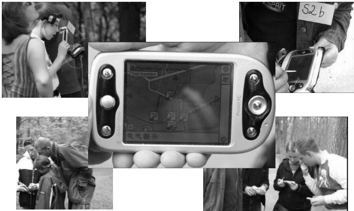
Figure 2. Field studies with the Mobile Guide to Nature during tours in a nature protection center

To evaluate this system, extensive field studies with various user groups, in particular school classes and families, were made, see Fig. 2 The participants were interviewed before and after the excursion, a camera was used for filming the excursion, and the electronic guide to nature was compared to a printed one.