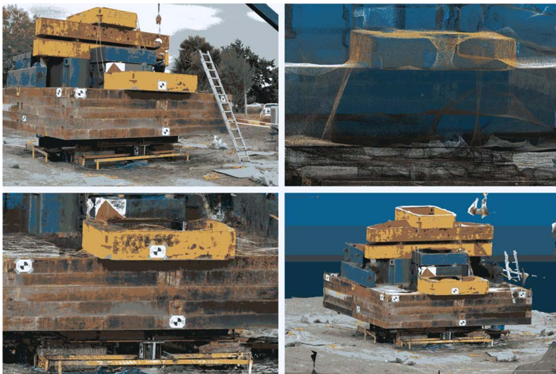
FIG. 1. Photograph of Christchurch test site (top left); screenshot of sparse point cloud (top right); screenshot of enhanced SfM point cloud with wireframe (bottom left); screenshot of fully meshed SfM model (bottom right)