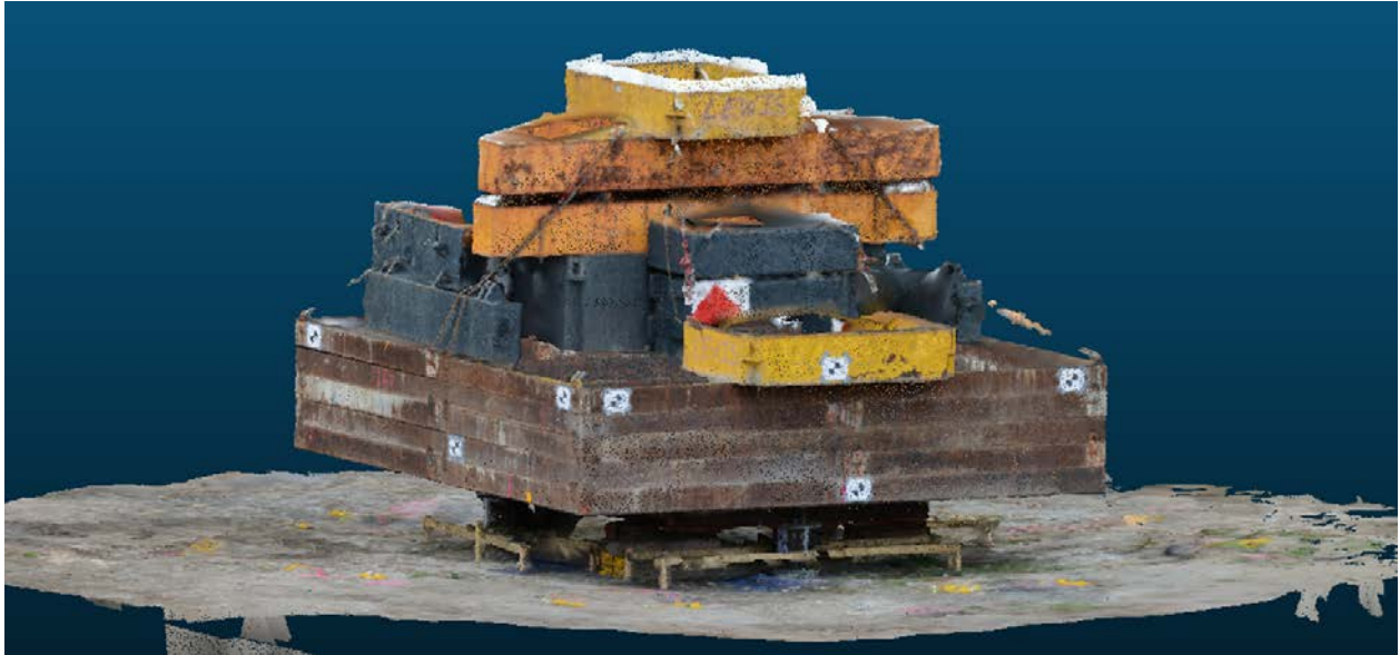
FIG. 3. Screenshot of the Christchurch meshed SfM model (after liquefaction blasting)