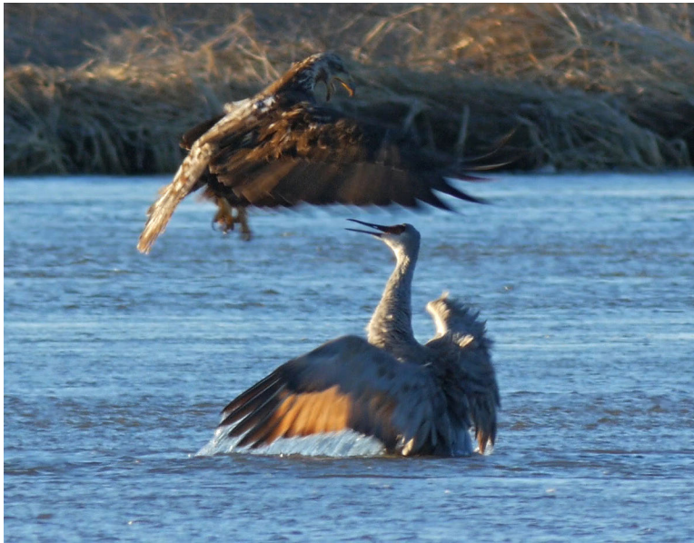
Fig. 1. Third-year Bald Eagle ( Haliaeetus leucocephalus ) hovering over an adult Sandhill Crane ( Antigone canadensis ) completing a defensive wing-spread display on 7 March 2017 in the main channel of the Platte River, Hall County, Nebraska, USA.

On 7 March 2017, we witnessed a BAEA attacking and potentially killing a SACR, as well as a group of 5 subadult BAEAs foraging on an additional SACR carcass. We observed the events from a viewing blind on the north bank of the main channel of the Platte River (40°45'40"N, 98°31'22"W, WGS 84; 600 m elevation) from a distance of about 350 m. We recorded the events with a Panasonic Lumix GH-4 camera equipped with a 400-mm lens and 2× extender (approximately 53× zoom). The viewing blind was located on the edge of a 617-ha property managed for the benefit of threatened and endangered species. At this location, the river channel was approximately 400 m wide. This river reach often supports one of the highest densities of roosting SACRs in the CPRV (Krapu et al. 2014). Weekly aerial surveys estimated at least 80,000 SACRs roosting within 1600 m of the viewing blind on the evening of 8 March 2017 (Crane Trust unpublished data).