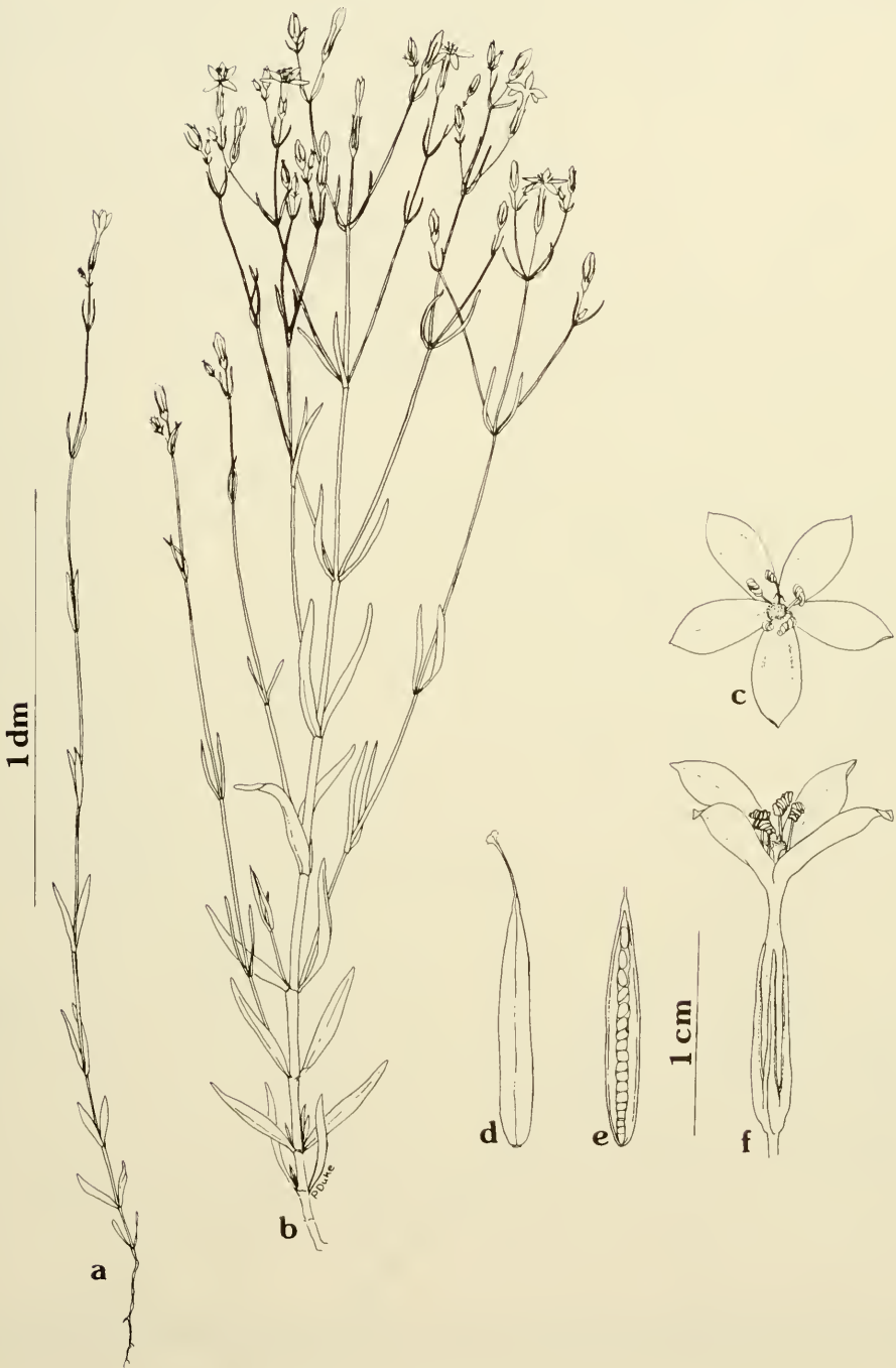
Fig. 1. Centaurium nanophilum var. nevadense . a,b, habits of two typical mature plants; c, top view of five-merous flower; d, mature capsule with persistent style; e, one valve of fruit showing the degree of placentar intrusion into locule and mature seeds within; f, four-merous flower in side view. (Illustration by Peggy K. Duke of the University of Maryland.)