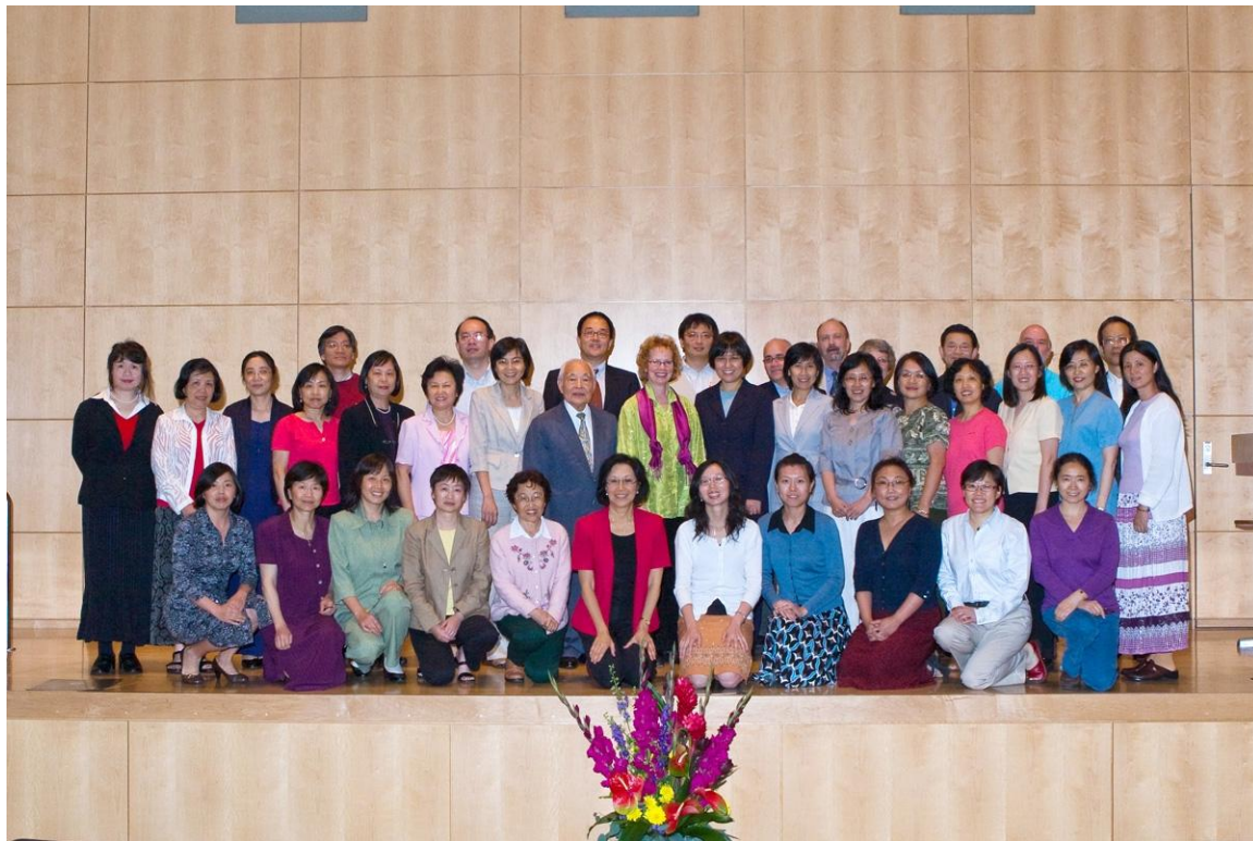
Group photo at graduation

The Summer Institute on Chinese Studies Librarianship in the Electronic Environment was a great success. It achieved its goals of providing booster training to renew the knowledge and skills of the practitioners of Chinese studies librarianship to prepare them for the challenges in handling electronic collections and services. It also enabled the participants to network and build professional connections with their colleagues, and served as a platform for participants to share experiences and skills. It was an institute to build leadership skills and to inspire innovative ideas for future Chinese studies librarianship of the digital age. Its significant impact on our profession will be felt by librarians and library users for many years to come.