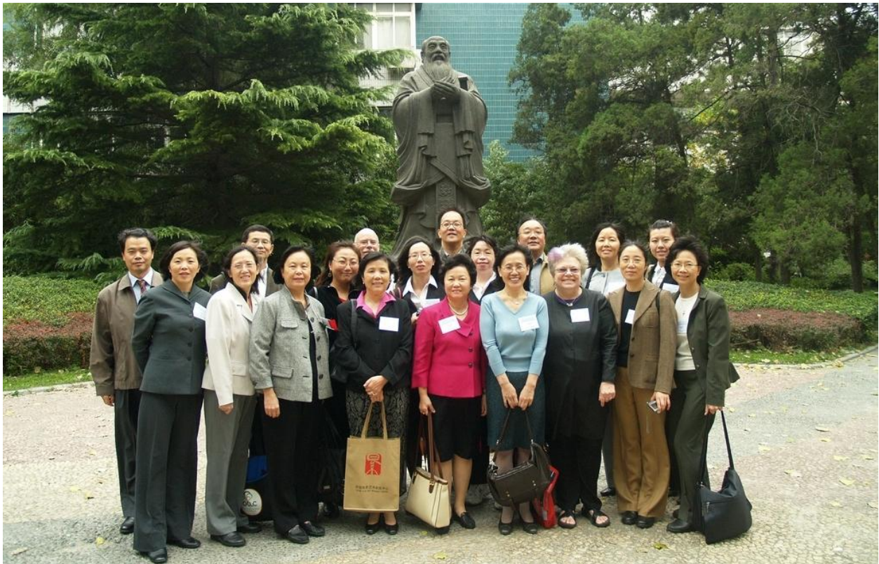
Group photo of field trip participants at Renmin University in Beijing