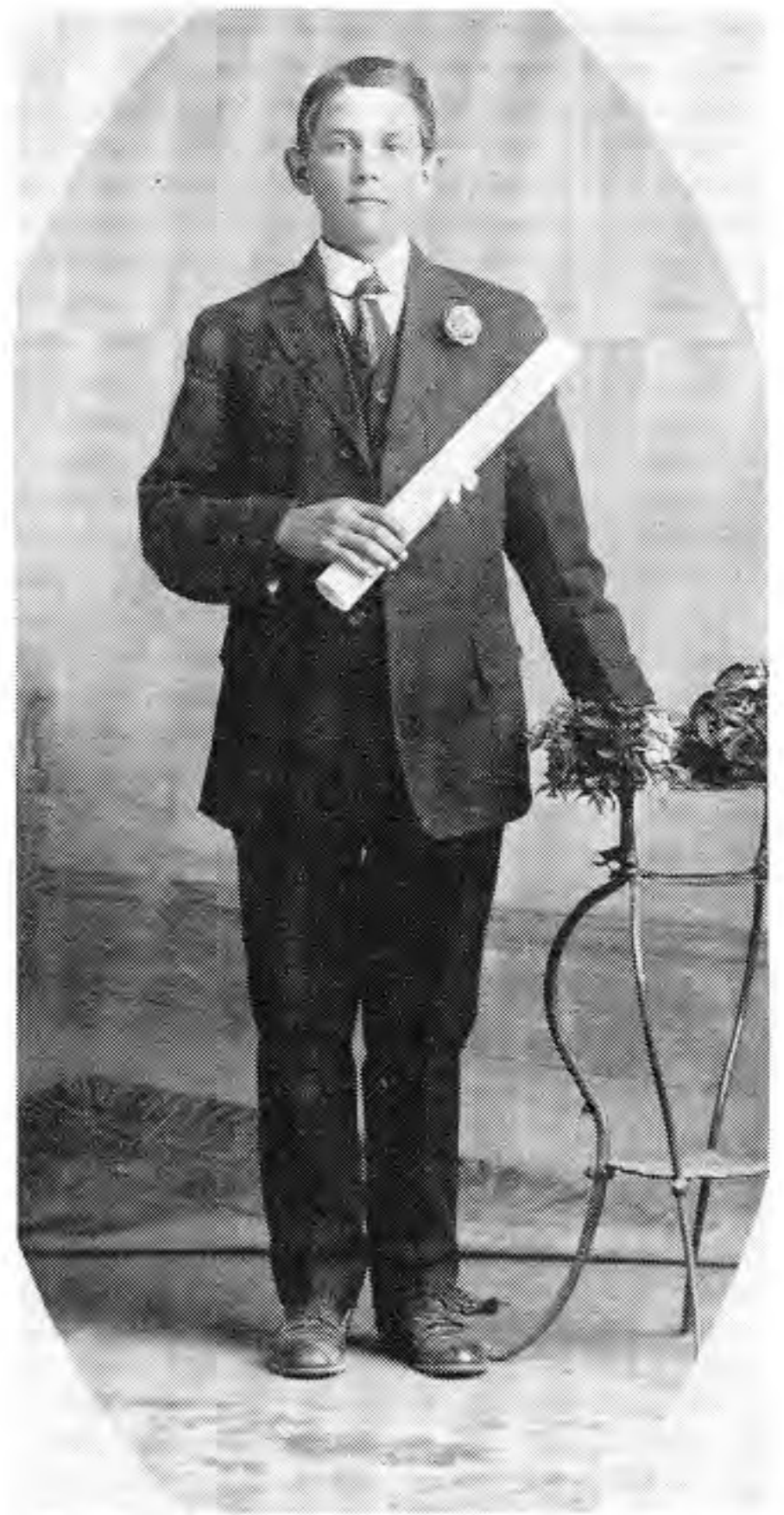
Eighth grade graduation, 1910