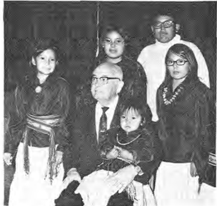
With Navajo children in Arizona, 1972