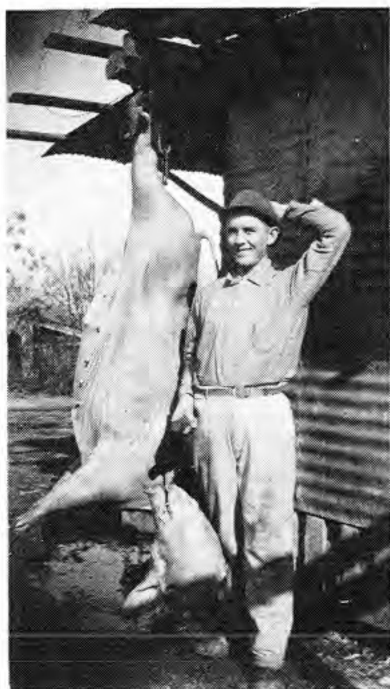
Hog-killing time, 1917