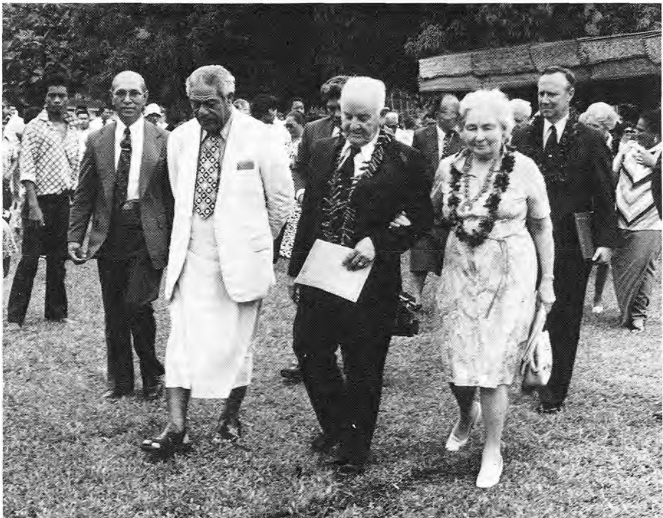
Samoa area conference, 1976