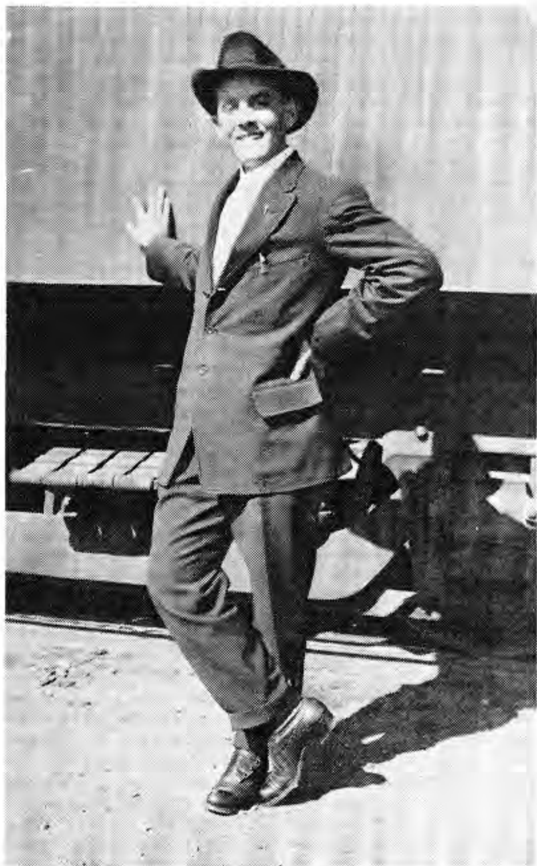
En route to the Central States Mission, 1914