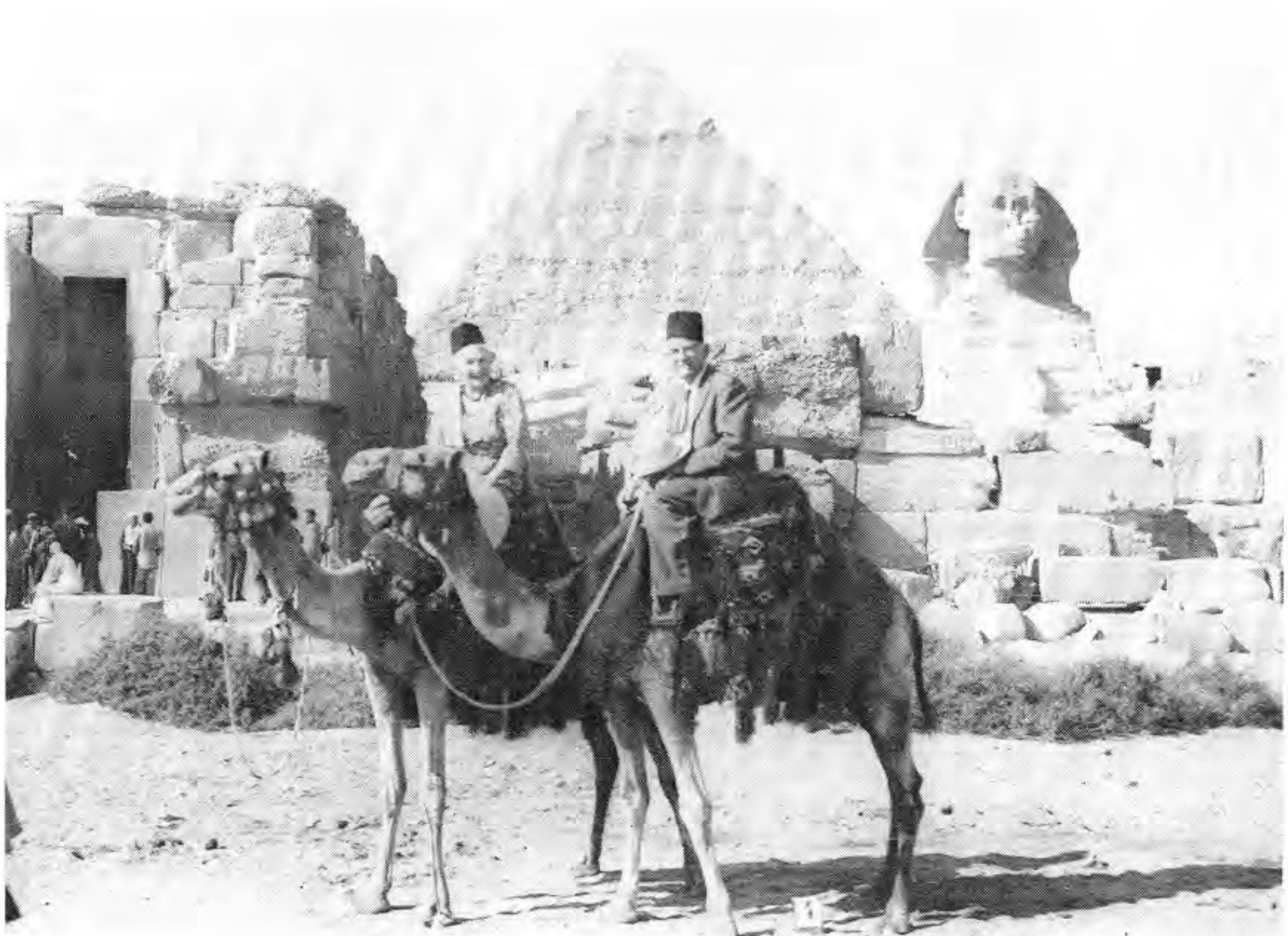
In Egypt, January 1961