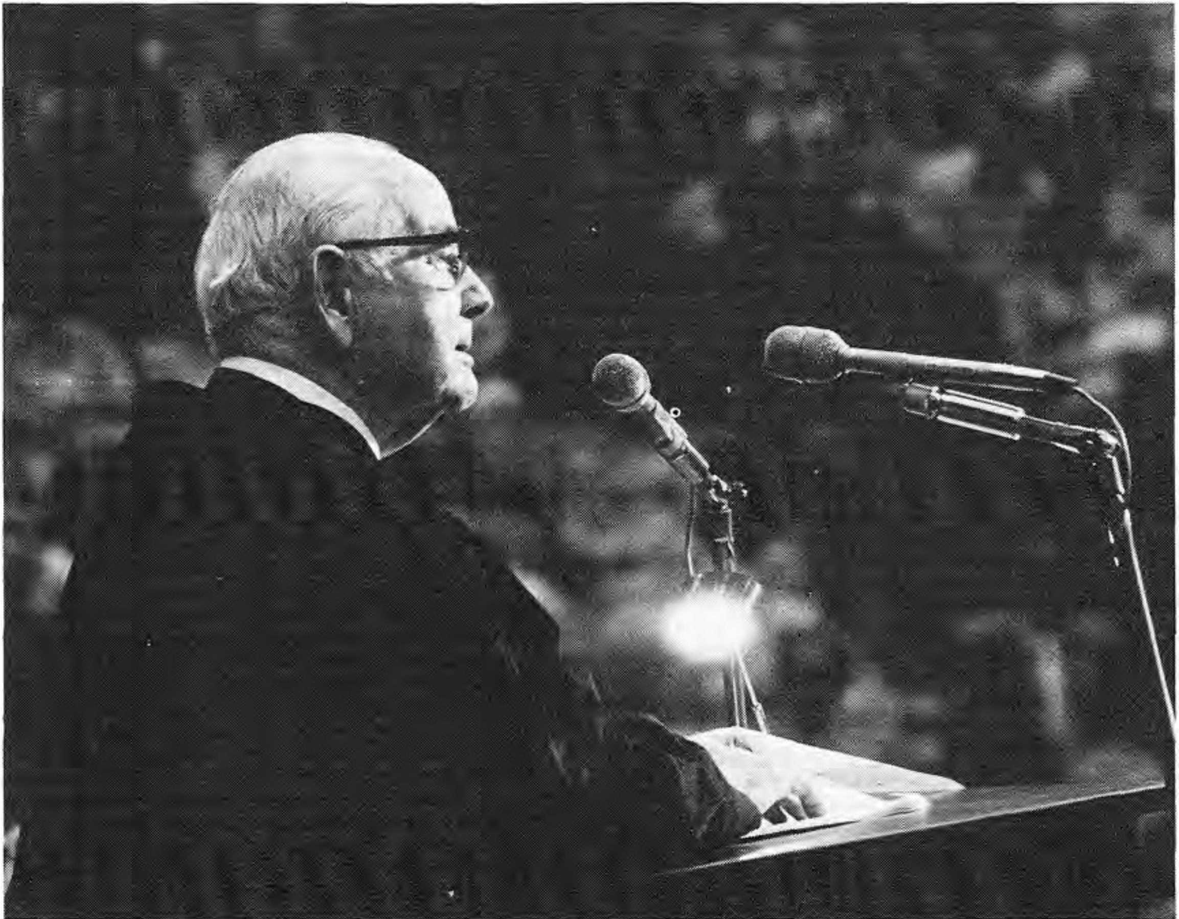
Utah State University baccalaureate service, 1975