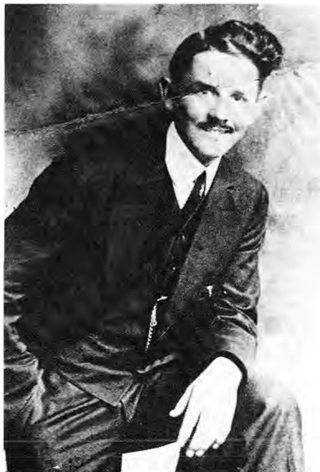
Spencer W. Kimball at the end of his mission