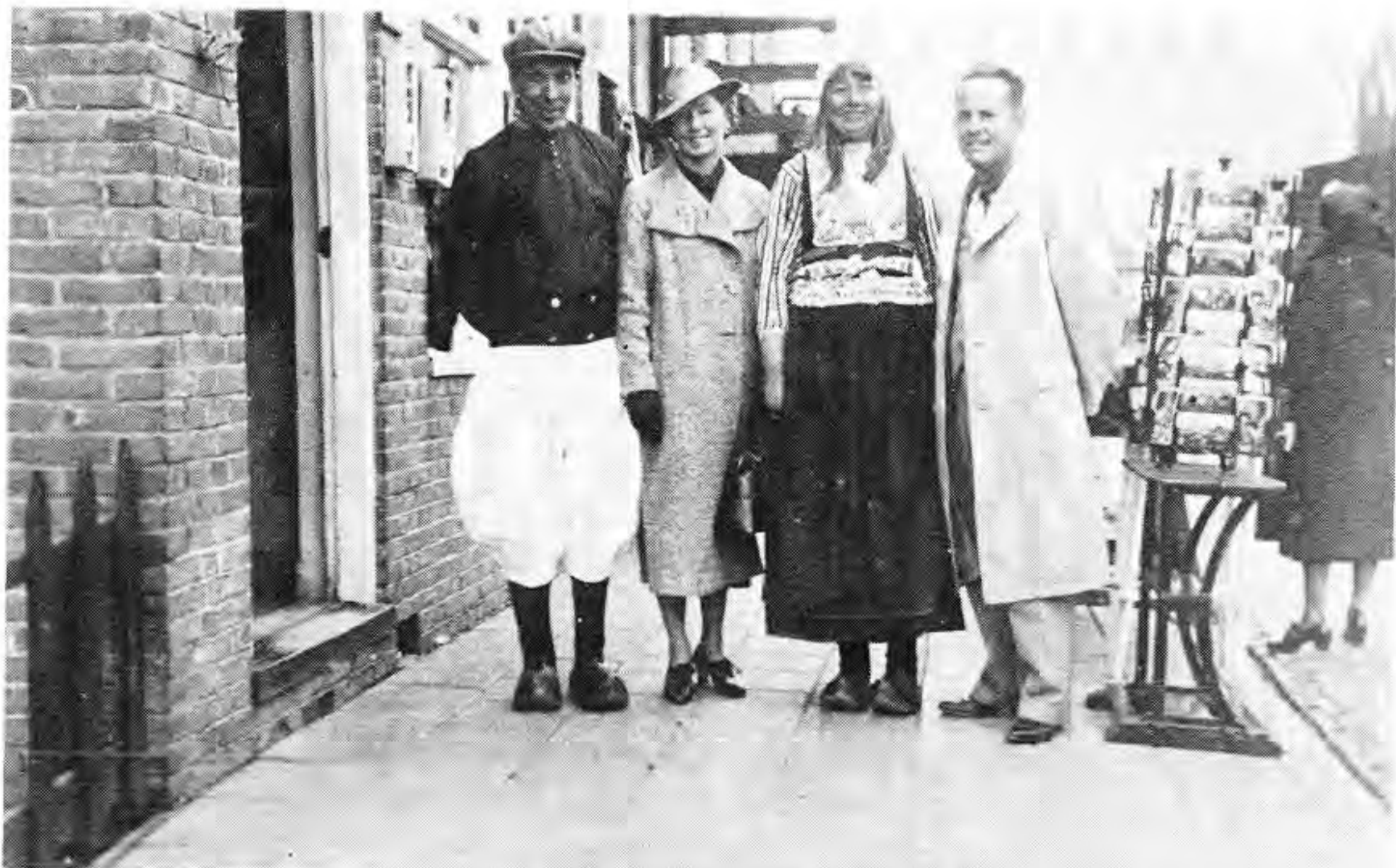
In Holland, 1937