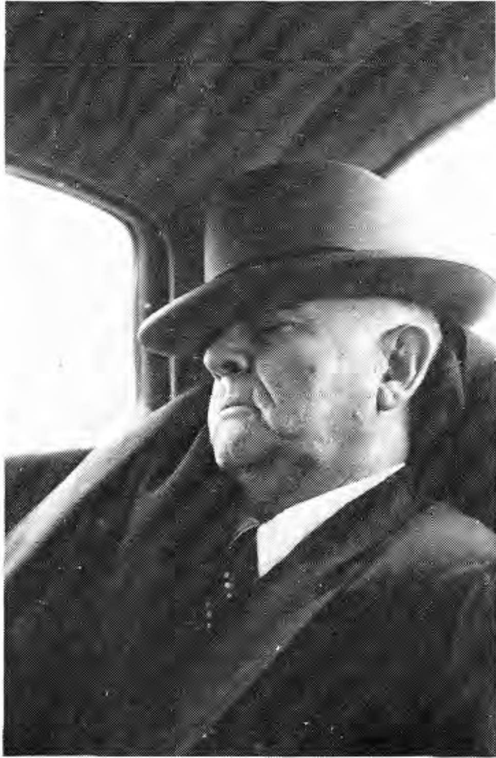
Napping during tour of European missions, 1955