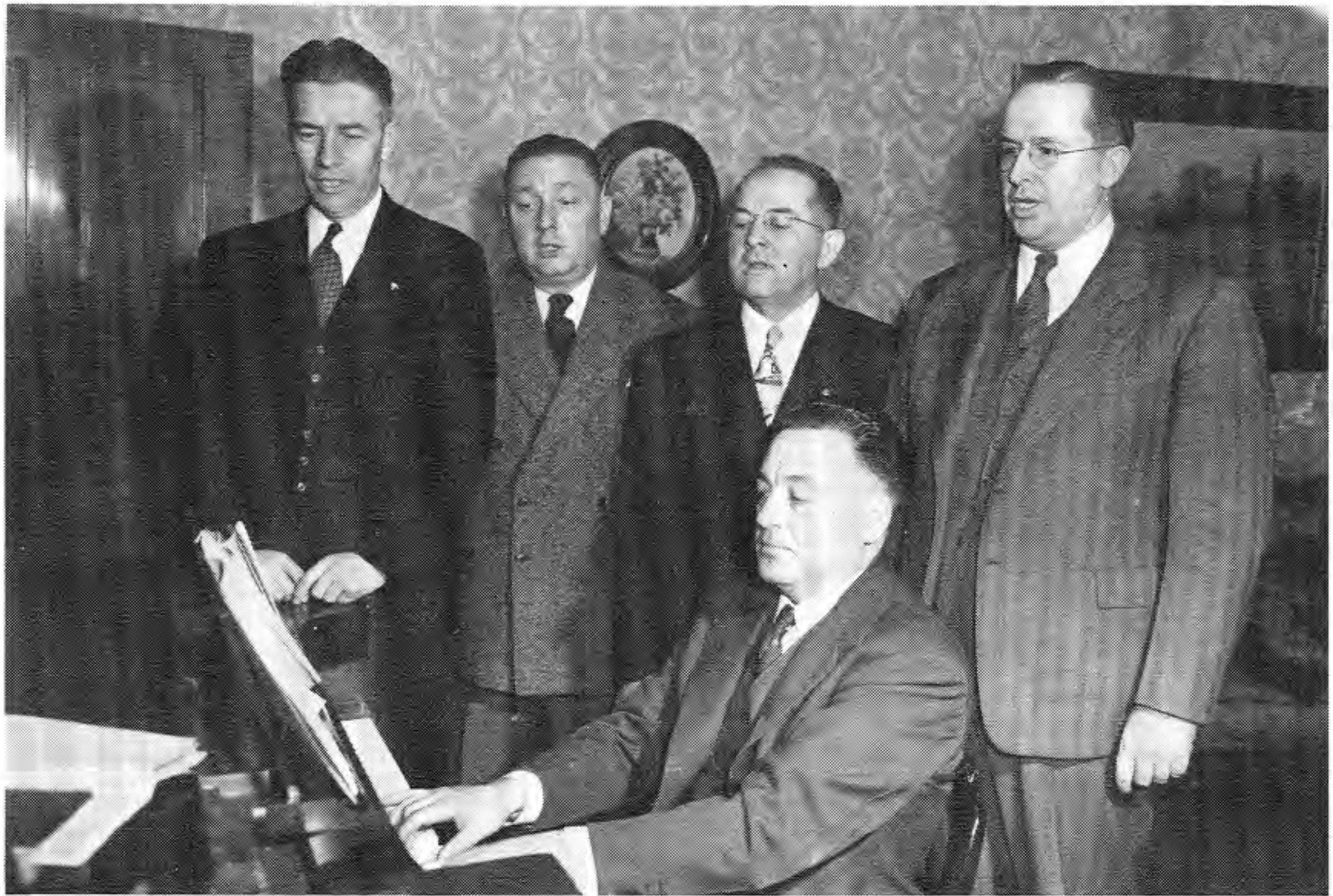
Mark E. Petersen, Matthew Cowley, Spencer W. Kimball, Ezra Taft Benson, and Harold B. Lee (seated), 1946