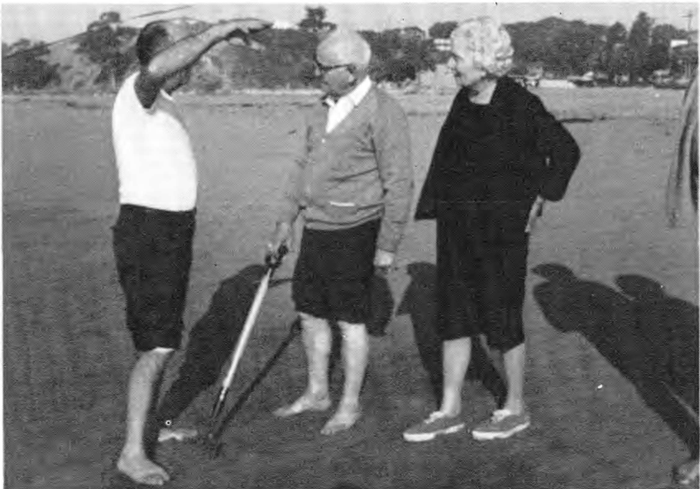
Near Santa Cruz, California, about 1968