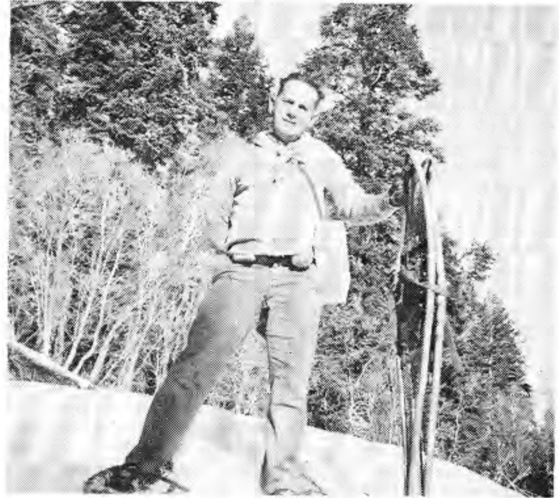
At Mount Graham, 1936