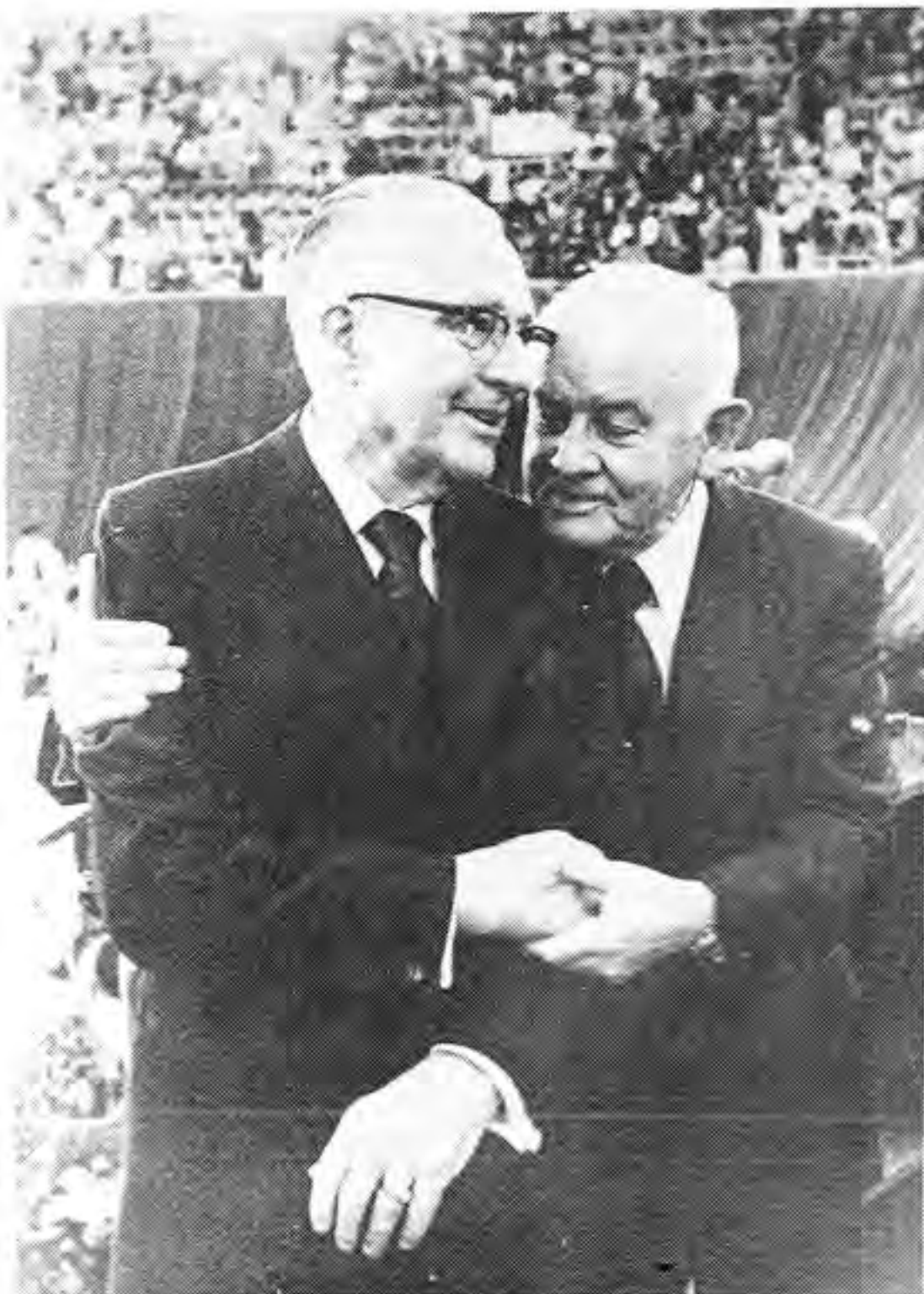
With Harold B. Lee, 1973