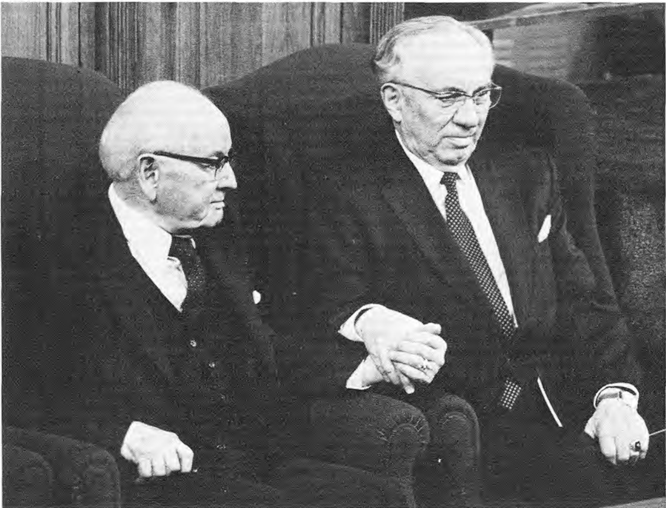
Spencer W. Kimball and Gordon B. Hinckley, general conference, April 1984