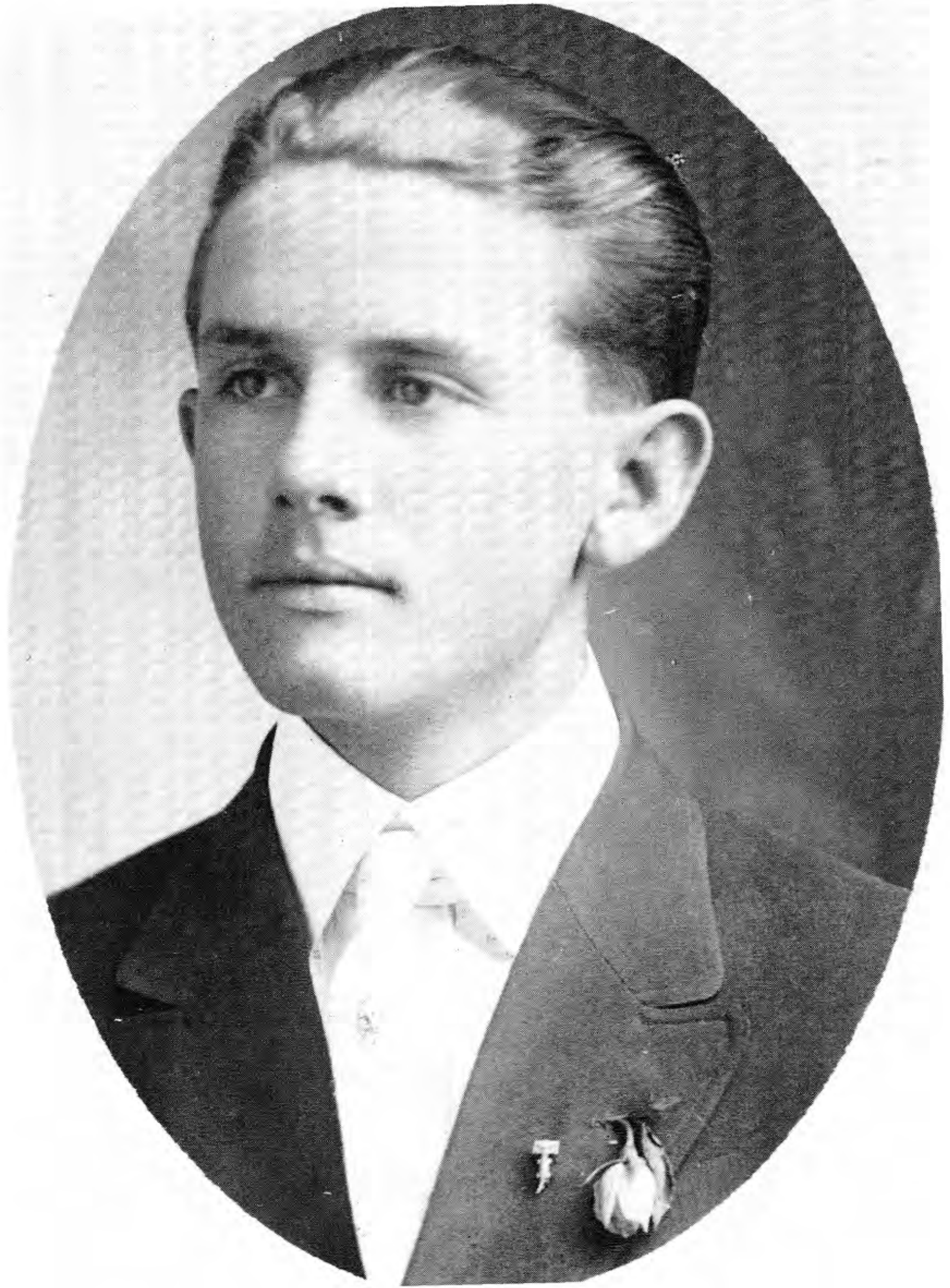
High school graduation, 1914