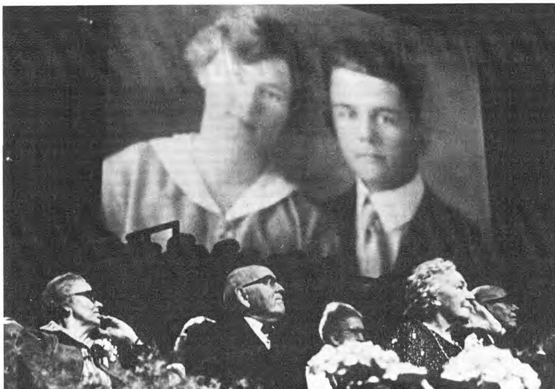
Eighty-fifth birthday celebration, 1980