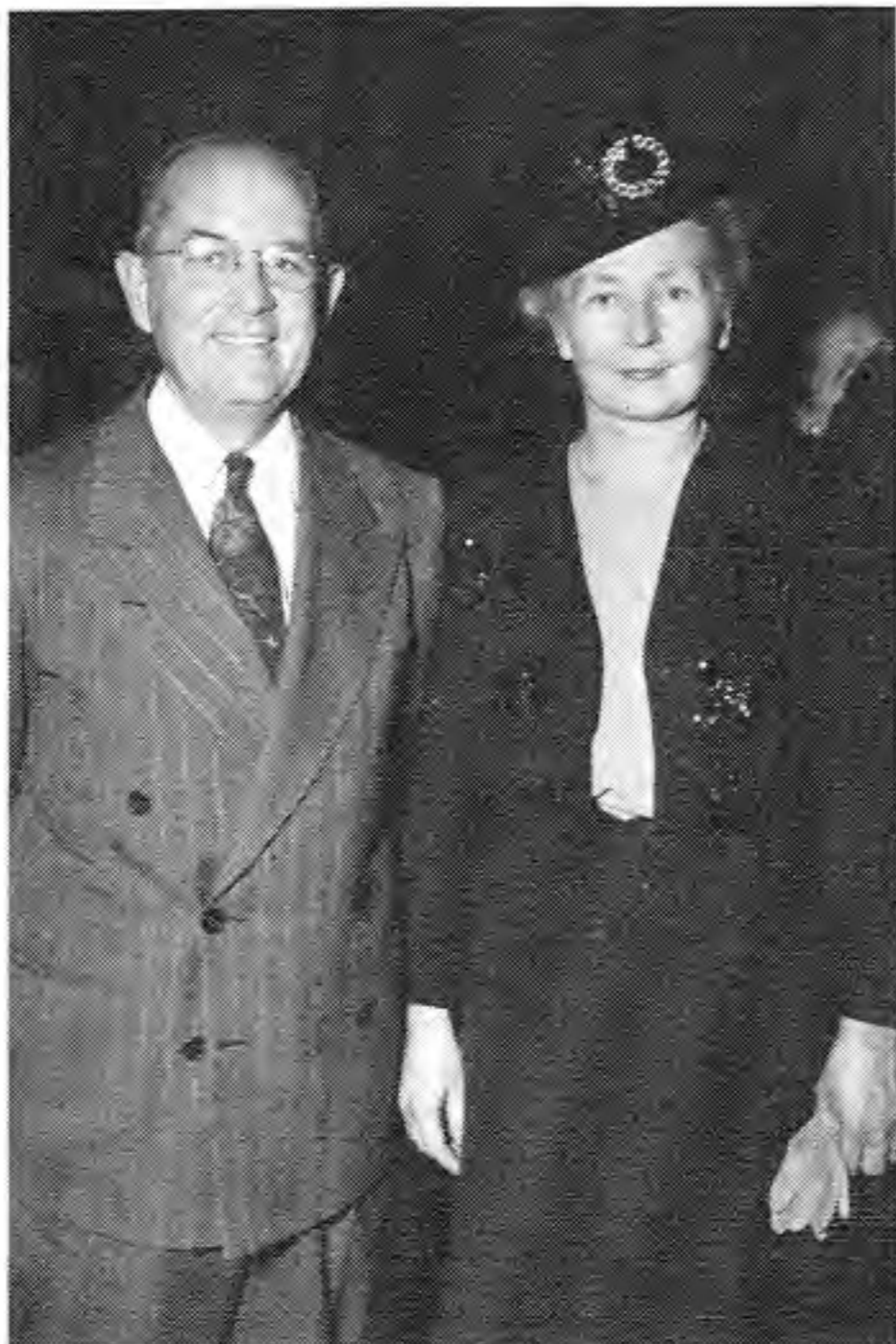
Spencer and Camilla, October 1947