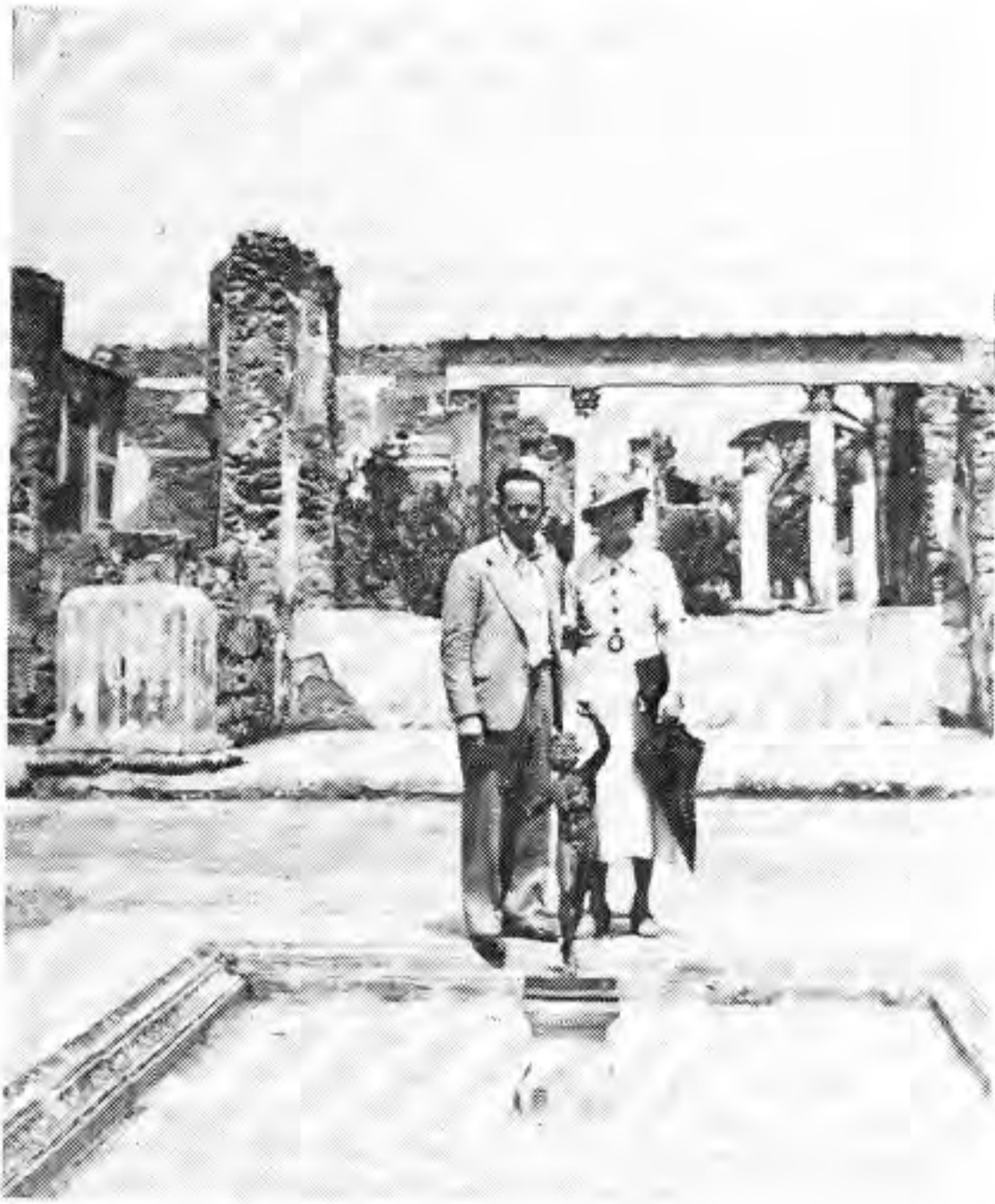
At Pompeii, 1937