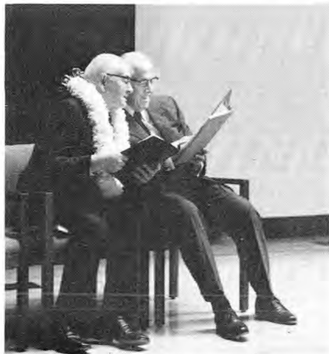
With Ezra Taft Benson, 1975