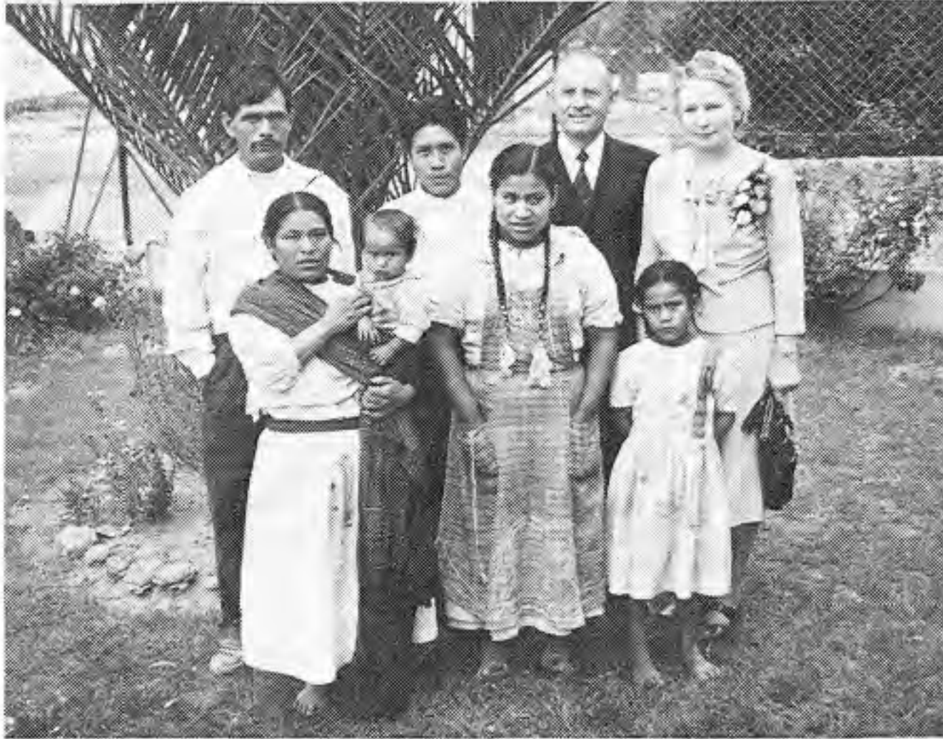
With Indian family in Mexico City