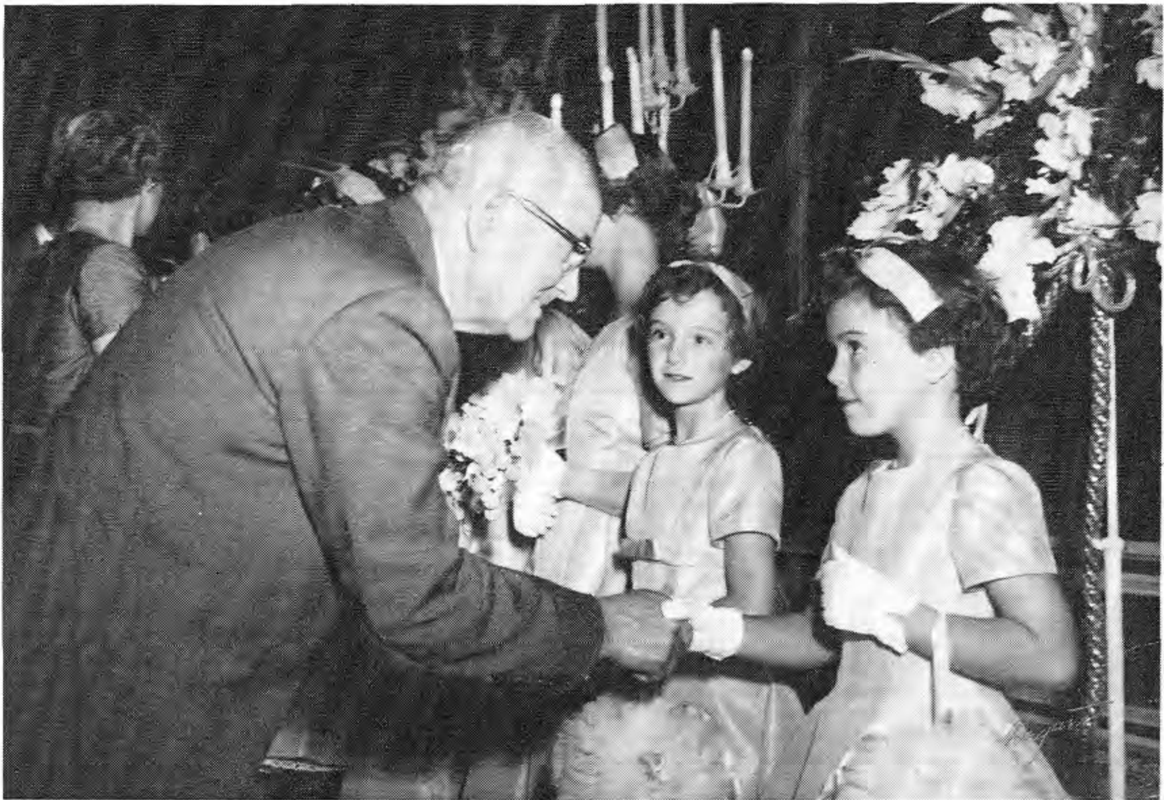
Wedding reception, 1959