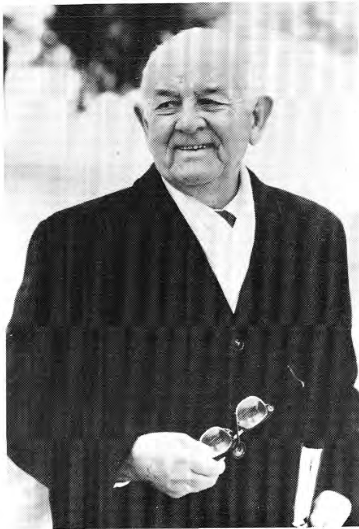
Spencer W. Kimball, 1979