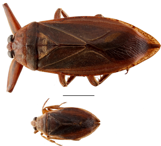
Fig. 2. Belostomatid taxa that occur in Saskatchewan: Lethocerus americanus Leidy 1847, 50 mm (above); and the new provincial record, Belostoma flumineum , 21 mm (below). Scale bar: 10 mm.

B. bakeri Montandon, B. confusum Lauck, B. ellipticum Latreille, B. flumineum , B. fusciven-