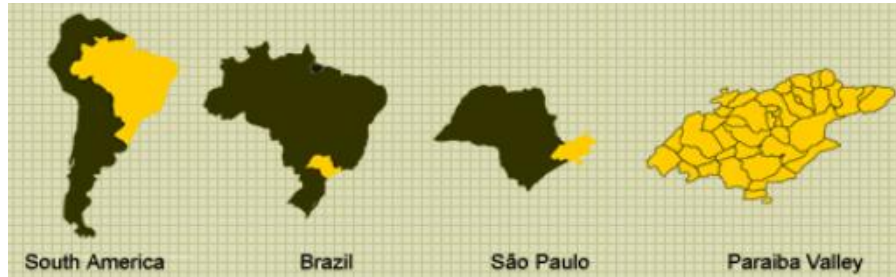
Figure 1. Paraíba Valley localization

The climate is subtropical warm, dry winter and low rainfall rates, with a mean annual precipitation of 1000 mm (with rainfall well distributed through the year). The mean annual temperatures ranging from 17°C to 20°C, with an annual average of relative humidity of 74.9%. Agricultural activities predominant in Pindamonhangaba are rice, leaf greens, coffee, and sugarcane, among others.