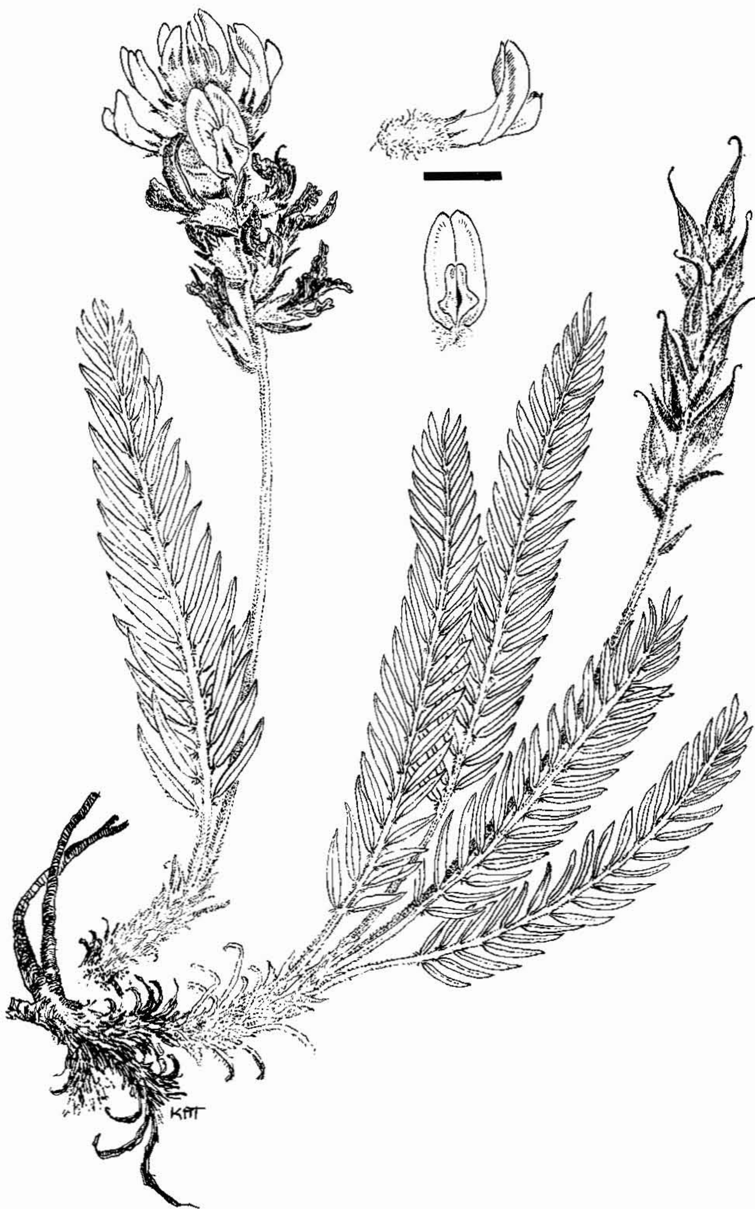
Fig. 1. Oxytropis campestris var. wanapum . Habit. Flower (bar = 1 cm). Composite drawing from Joyal 467, 1264, and photos of the Saddle Mountain population.