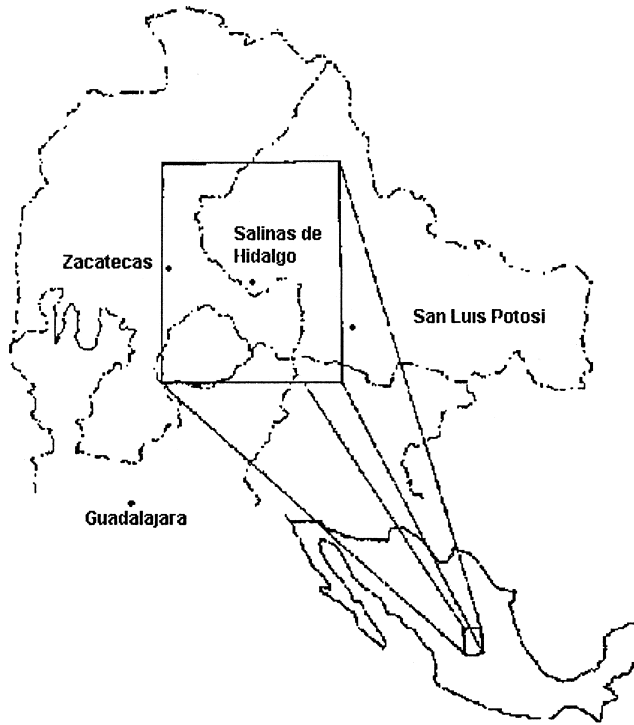
Fig. 1. Study area location near Salinas de Hidalgo, San Luis Potosí, within the Altiplano Potosino-Zacatecano, southern Chihuahuan Desert, central Mexico.

grassland area, but control efforts have not always been successful (Havstad et al. 1999, Rango et al. 2005).