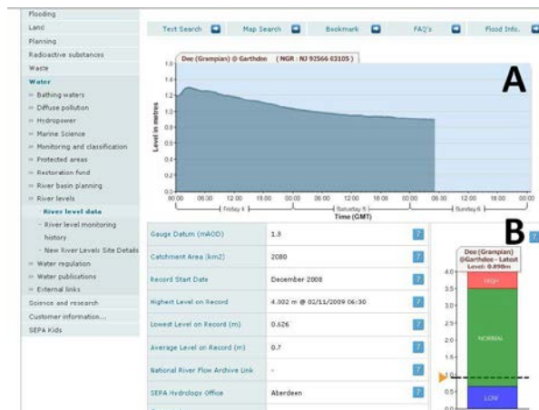
Figure 2. An example of how online river level data is currently presented. A- river level data, B- current river state in relation to long term annual statistics.

Through interviews we have discovered that the starting point for portrayal of water level data was a sense that the results from major financial investment in data collection needed to be visible to the public to ensure continued public funding. There is a strong desire at senior and operational levels in SEPA that greater access to the river level data is provided to water users, but there are internal issues of how and what is presented. Despite the wide use of the river level data web pages, operational staff struggle to secure time and resources to enable further development of these pages. There is not a proactive organisational attitude to data sharing.