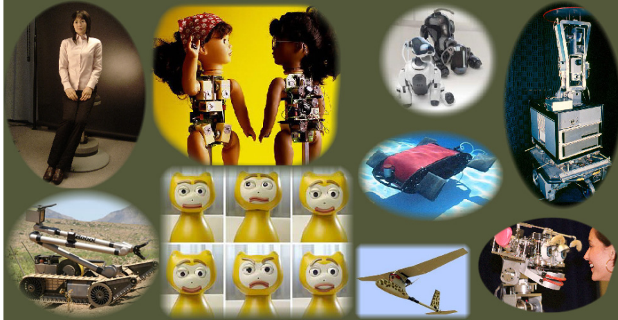
Fig. 4.1 Representative types of robots. In clockwise order beginning in the upper left: RepileeQ2 — an extremely sophisticated humanoid [136]; Robota — humanoid robots as “educational toys” [21]; SonyAIBO — a popular robot dog ; (below the AIBO) A sophisticated unmanned underwater vehicle [176]; Shakey — one of the first modern robots, courtesy of SRI International, Menlo Park, CA [279]; Kismet — an anthropomorphic robot with exaggerated emotion [65]; Raven — a mini-UAV used by the US military [186]; iCAT — an emotive robot [REF]; iRobot® PackBot® — a robust ground robot used in military applications [135]. (All images used with permission.)

trolled by a human (i.e., teleoperated), through the entity being completely autonomous and not requiring input or approval of its actions from a human before taking actions: