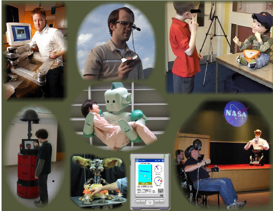
Fig. 4.3 Types of human–robot interaction. Counterclockwise from top left: haptic robot interaction from Georgia Tech [102], a “physical icon” for flying a UAV from Brigham Young University, peer-to-peer interaction with the robot Kaspar from the University of Hertfordshire [298], teleoperation of NASA’s Robonaut [205], a PDA-based interface for flying a UAV from Brigham Young University, gesture- and speech-based interaction with MIT’s Leonardo [189], a touchscreen interaction with a Cogniron robot [169], and (center) physical interaction with the RI-MAN robot [24]. (All images used with permission.)