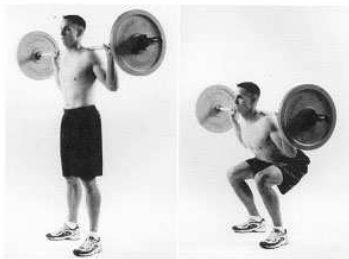
Figure 1. On the right is the starting position for the back squat and on the left is the bottom position of the squat. Note the position of the bar across the back of the shoulders.

Front Squat - A strength training exercise in which a lifter squats down till their thighs are parallel to the ground and then returns to a standing position while keeping their back as upright as possible and holding a weighted barbell supported on the front of the shoulders (figure 2).