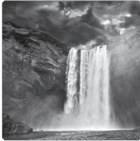
On the cover: The spectacular Skógafoss Waterfall on the Skógá River in the south of Iceland.