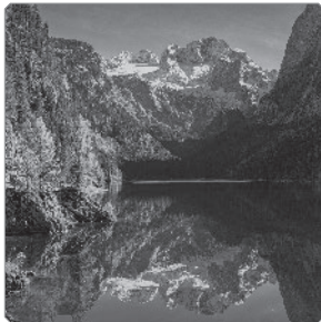
On the cover: Beautiful view of idyllic colorful autumn scenery with Dachstein mountain summit reflecting in crystal clear Gosausee mountain lake in fall, Salzkammergut region, Upper Austria, Austria.