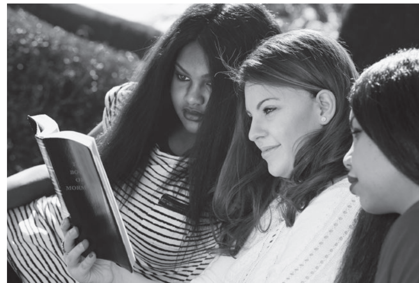
Youth are motivated to read scripture because it makes them feel loved and gives them a sense of peace, comfort, and security.

At one level, contexts can refer to the instructional settings in which literacy and learning activities occur. 13 We might call this instructional environment "activities in context" 14 because it represents a more immediate setting for literacy learning that can include and be informed by social relationships, the arrangement of the physical classroom space, and the purposes of classroom literacy instruction. Activities in context can also include specific instructional activities and the classroom's cultural norms. At another level, contexts can represent the larger cultural and historical environments in which readers, texts, and activities interact to inform motivation for literacy.