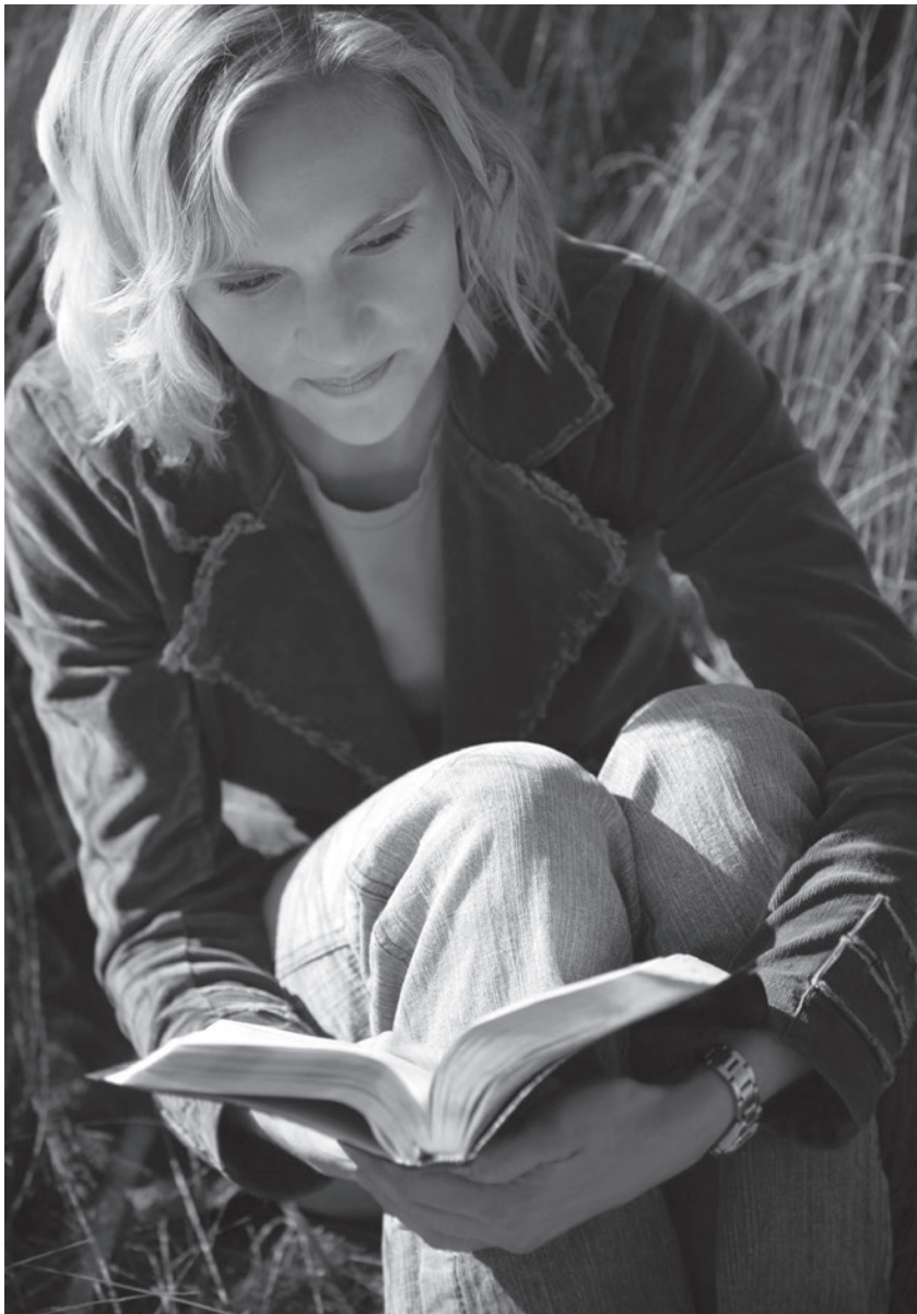
Because God can speak to us through scripture, we could invite youth to listen for his voice as they read.