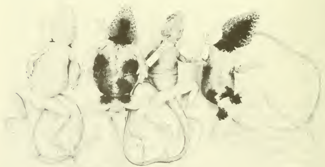
Fig. 2. A ventral view from left to right of Crotaphytus collaris bicinctores , female BYU 23629, male BYU 23883 and Crotaphytus insularis vestigium , female BYU 23337, male BYU 23338.