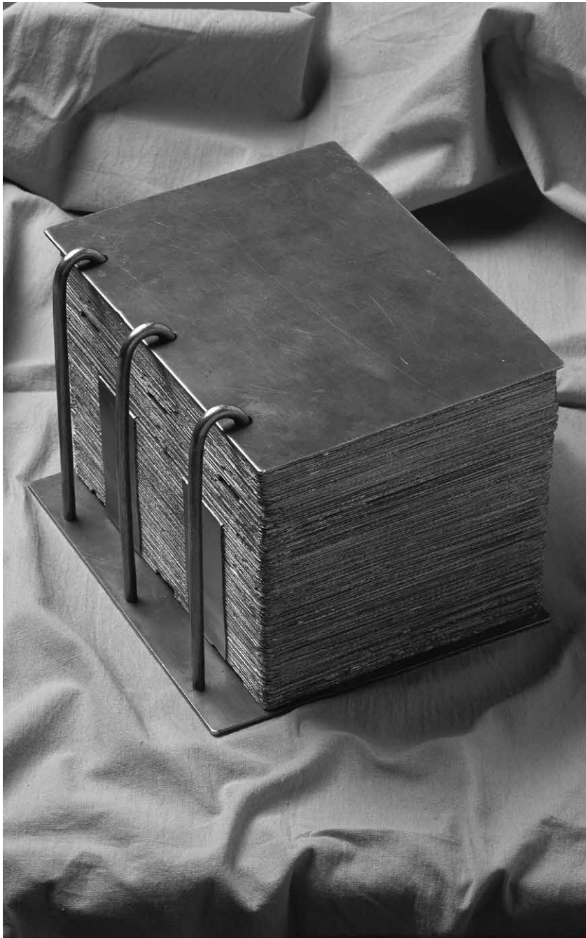
A replica of the gold plates.